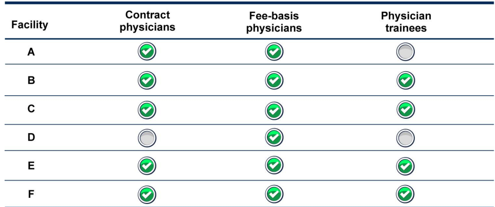
Figure 1: VAMCs' Use of Contract Physicians, Fee-Basis Physicians, and Physician Trainees for Mission-Critical Physician Occupations at the Six VAMCs Reviewed for Our October 2017 Report