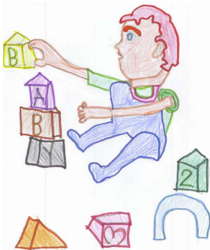
Olivia, Age 8

CDC will work steadfastly in the coming years to advance our science to inform and bolster individuals’ actions, support systems-level changes, and train future cohorts of experts to accelerate the prevention of birth defects.