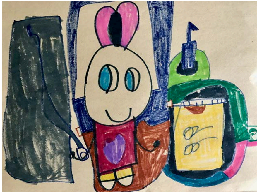
Rivers, Age 5

CDC will continue its work in blood disorder surveillance, research, and primary and secondary prevention in pursuit of our long-term goal of protecting people and preventing complications of blood disorders.