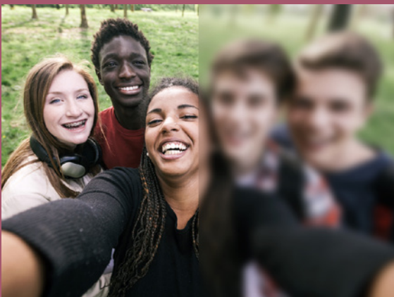
Potential vision loss caused by UV damage to the eye