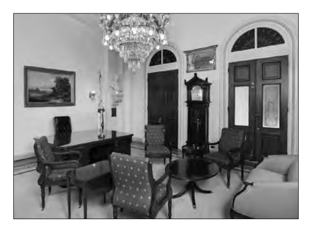
The vice president's Capitol office

The United States Senate's Vice Presidential Bust Collection honors the presidents of the Senate and forms the institution's oldest continuing art collection. The Senate commissioned the first bust in 1885 as a tribute to Vice President Henry Wilson and placed it in the Vice President's Room, adjacent to the Senate Chamber.