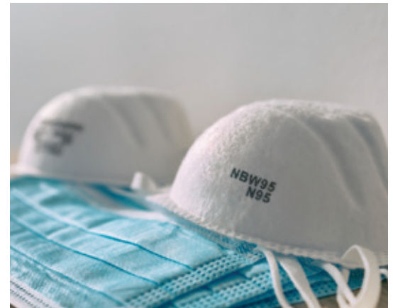
N95 respirators and surgical masks