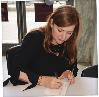
25,462 letters + emails responded to