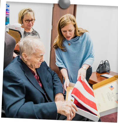
825 constituent cases closed