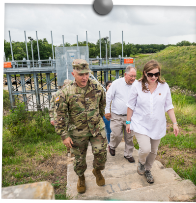
79 site visits