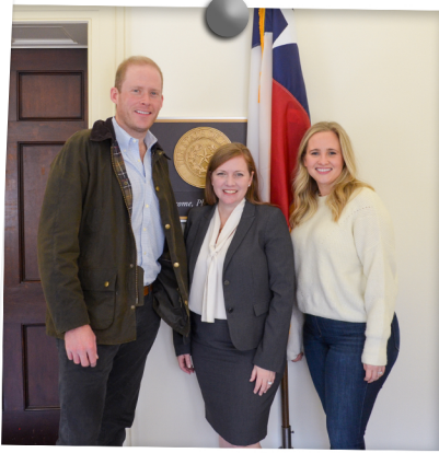
422 Capitol Tours