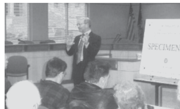
Rep. DeFazio speaks to constituents about his plan for the future of Social Security at a Town Hall meeting in Albany.

While we must provide our troops with the equipment and resources they really need (including increased pay and benefits and improved housing) to protect the U.S. and carry out the military campaign against terrorism, that doesn't justify giving the Pentagon a blank check. It is even more important, in time of military conflict, that Congress demand fiscal accountability to ensure our nation is prepared to combat the gravest threats to our security without unnecessarily diverting funds from other essential programs.