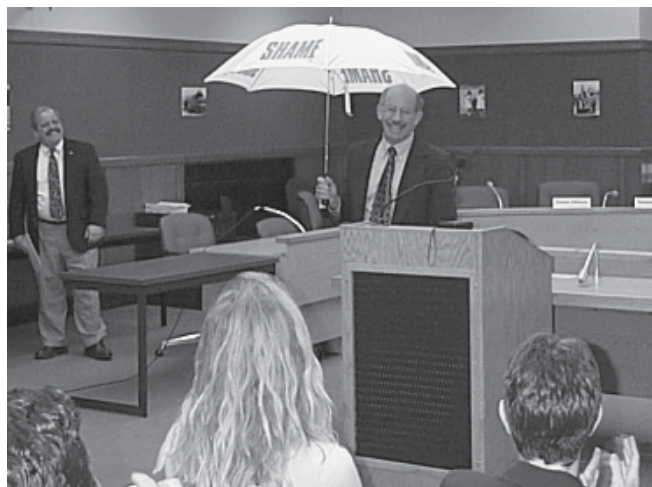
Rep. DeFazio visits the state capitol to oppose the lawmakers' decision to deregulate energy in Oregon.

Energy rates jumped by nearly 40 percent in Oregon