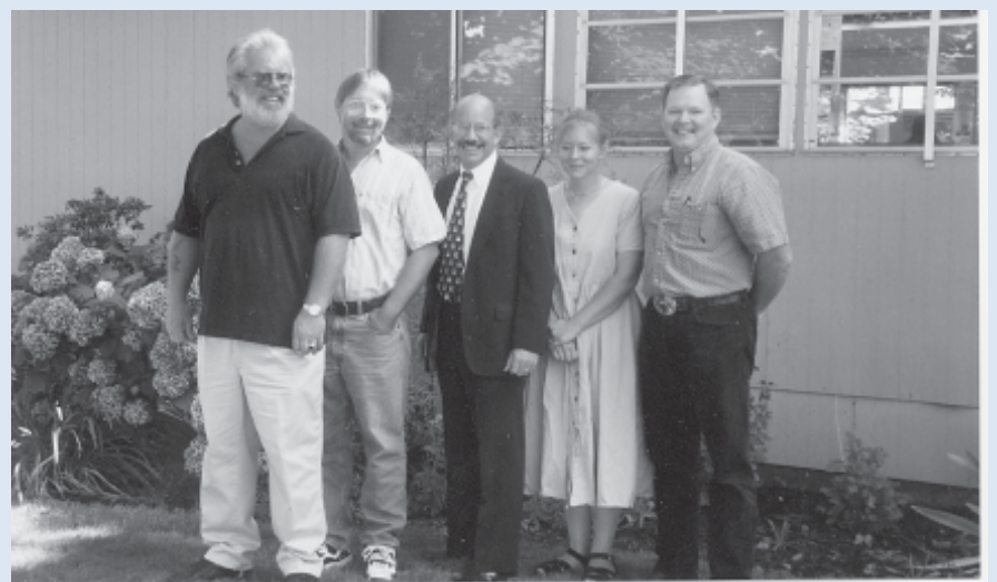
Peter DeFazio meets with scholarship recipients to discuss federal support for education.

For more than a decade, I’ve refused large Congressional pay raises with the conviction that cuts to balance the budget should start at the top. After coming to Congress, I pledged to not take a pay raise until the federal budget was balanced, and linked my salary to the cost of living adjustments received by Social Security recipients. To date, I’ve turned back more than $200,000. A portion of this has gone to the U.S. Treasury to help retire the national debt.