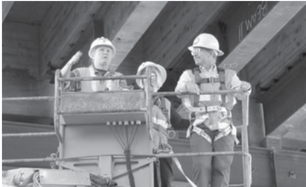
Oregon needs $3 billion to fix the state’s bridges. Rep. DeFazio joined an official from ODOT to inspect a failing I-5 bridge in Canyonville.

I led the Oregon House delegation in a successful effort to get the Bush Administration to release nearly $8 million in emergency worker assistance to Oregon,