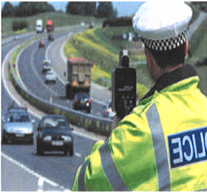
Washington: Say Bye to Your Auto Insurance Bill if You Live in These Zip Codes