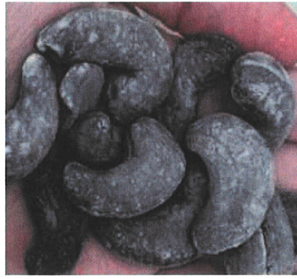
Metformin Users: the Truth Behind What Big Pharma Has Been Hiding from You