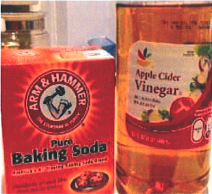
Want To Reduce Your Size? Try This Formula For 1 Week!