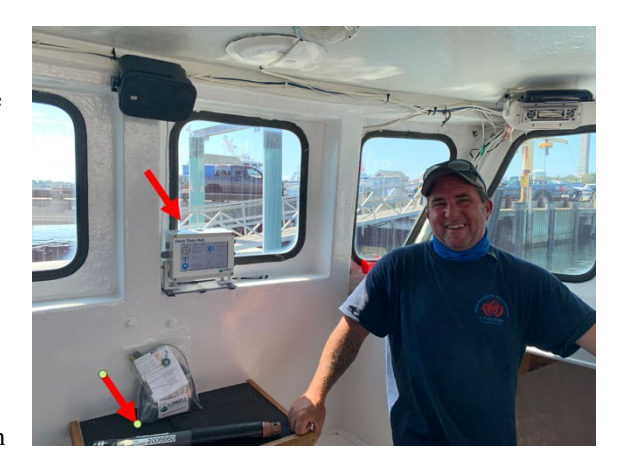
Figure 4. Dissolved oxygen sensor (lower red arrow) and deck display (upper red arrow) being used by New England lobstermen to track the onset of hypoxia on the East Coast

Working at a public university, I also see firsthand the value proposition of a blue high-tech economy. Investing in innovations is investing in workforce development. A student that is inspired to blend artificial intelligence with sensors that survive the bottom of the ocean or the inside of a commercial crab pot will have the kinds of creative, technical problem-solving skills that are vital to our economy. There is much work to do and we need to make sure that inquisitive and creative students from economically challenged communities, be it the coast, the inner-city of Portland, or the high desert are not left behind. We need to make sure that they have access to opportunities that give them an onramp to the growing blue economy.