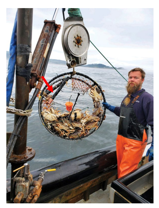
Figure 3. Commercial crabber bringing on deck a crab pot equipped with a smart dissolved oxygen sensor (red arrow) developed with support from NOAA NCCOS' Coastal Hypoxia Research Program.

Innovations also take the form of new ideas. At OSU, researchers are working to stimulate a new marine climate insurance industry that would help seafood growers and harvesters be more climate-resilient. On land, farmers have access to insurance products to safeguard their livelihoods against drought and weather events. For fishermen dealing with increasing marine heatwaves or hypoxia, that's not an option. This is due in part to a lack of access to scientific information, such as the frequency and severity of events that would allow insurers to adequately price risk. Some of this information is already in hand and some will require further research, but this is the kind of blue economy opportunity that NOAA's vision for climate products and services can catalyze. Importantly, a marine climate insurance industry would give seafood growers and harvesters a tool to adapt to the uncertainties that continued climate change will bring.