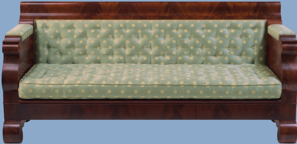
John Quincy Adams Box Sofa, c. 1835 COLLECTION OF THE U.S. HOUSE OF REPRESENTATIVES