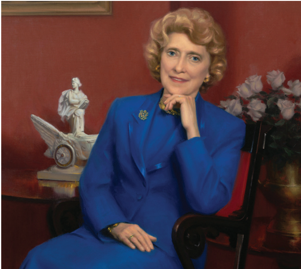
Lindy Claiborne Boggs , NED BITTENDER, 2004 COLLECTION OF THE U.S. HOUSE OF REPRESENTATIVES

This portrait of Lindy Boggs hangs in the reading room's foyer. To show her deep love of history, it includes a small replica of the Car of History clock. The 1819 original is located just outside the Lindy Boggs room, in the old Hall of the House (now National Statuary Hall). Boggs's interest in history led her to chair the Commission of the United States House of Representatives Bicentenary. Boggs championed women's rights and was the first woman to chair a major political convention.