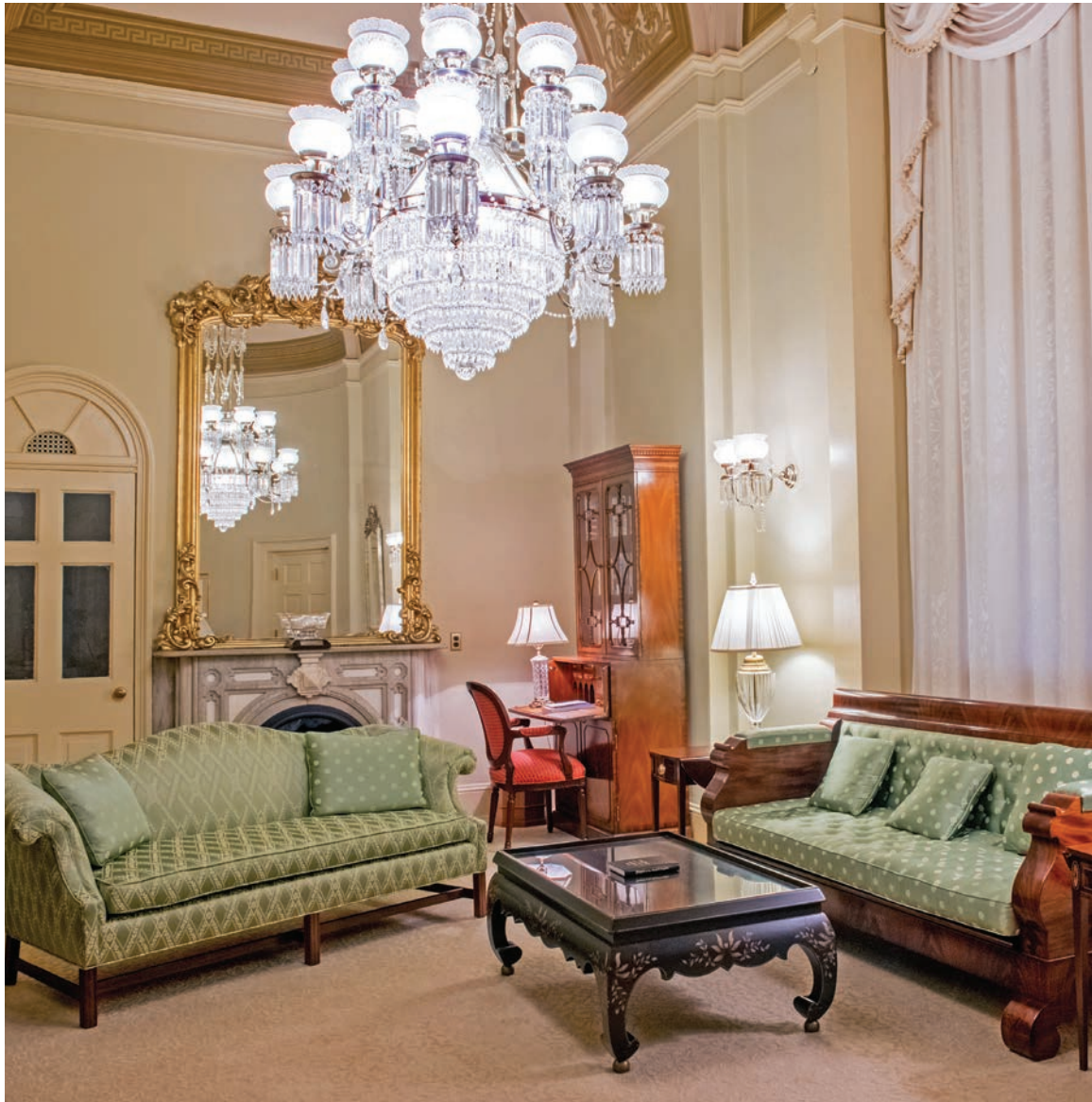
The Lindy Claiborne Boggs Congressional Women's Reading Room, 2016 COLLECTION OF THE U.S. HOUSE OF REPRESENTATIVES