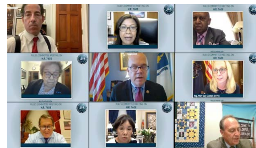
Chairman McGovern remotely chairs a Rules Committee meeting September 30, 2020.