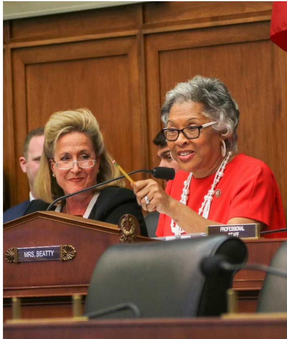
Chairwoman Beatty (D-OH) and Ranking Member Wagner (R-MO) chair a subcommittee meeting.

Chairs Waters and Beatty also released a comprehensive report on diversity and inclusion practices at the nation's largest banks, held hearings, and issued recommendations on better diversity and inclusion practices at big banks.