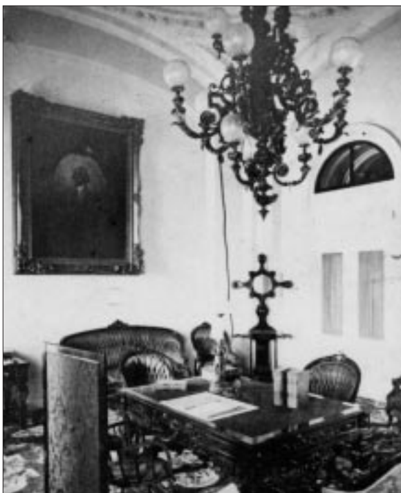
Earliest known photographic view of the room, c. 1870

The United States Constitution designates the vice president of the United States to serve as president of the Senate and to cast the tie-breaking vote in the case of a deadlock. To carry out these duties, the vice president has long had an office in the Capitol Building, just outside the Senate chamber.