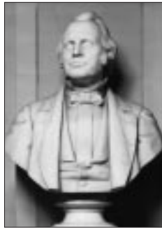
Henry Wilson by Daniel Chester French, 1885

In 1885, the Senate voted to place a marble bust of Henry Wilson in the Vice President's Room, to honor one of the Senate's most popular presiding officers. Before being elected vice president, Wilson had served as a senator from Massachusetts from 1855 to 1873. He played an important role during the Civil War, as chairman of the Senate Military Affairs Committee, and throughout his career championed legislation to aid the working class.