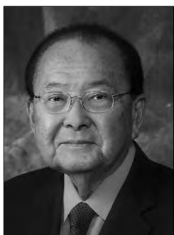
Daniel K. Inouye (D-HI) Chairman 2009–2012

Senator Daniel K. Inouye served on the Appropriations Committee from 1971 until his death in 2012. Born in Honolulu, Hawaii, on September 7, 1924, Inouye served in the U.S. Army's 442nd Regimental Combat Team during World War II. Composed of soldiers of Japanese ancestry, the 442nd became one of the most decorated military units in U.S. history. For his combat heroism, which cost him his right arm, Inouye was awarded the Congressional Medal of Honor, the Distinguished Service Cross, the Bronze Star, and the Purple Heart with Cluster. He entered political life after graduating from the University of Hawaii and the George Washington University Law School, becoming one of Hawaii's first representatives in Congress in 1959. Elected to the Senate in 1962, Inouye gained national distinction in the 1970s as a member of the Senate Watergate Committee and in 1987 as chairman of the Senate Iran-Contra Committee. He served as the Senate's president pro tempore from 2010 to 2012.