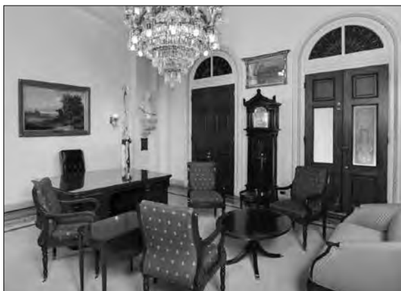
The vice president's Capitol office

The United States Senate's Vice Presidential Bust Collection honors the presidents of the Senate and forms the institution's oldest continuing art collection. The Senate commissioned the first bust in 1885 as a tribute to Vice President Henry Wilson and placed it in the Vice President's Room, adjacent to the Senate Chamber.