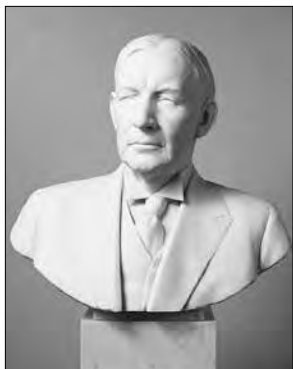
Charles G. Dawes (1865–1951) ③0 Jo Davidson, 1930

design for the American buffalo nickel. More than 25 years after sculpting the Roosevelt bust, Fraser created the marble bust of Vice President John Nance Garner for the Senate collection.