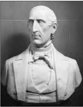
John Tyler (1790–1862) 10