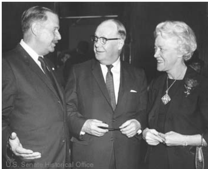
Senators Hugh Scott (R-PA), Karl Mundt (R-SD), and Margaret Chase Smith (R-ME)