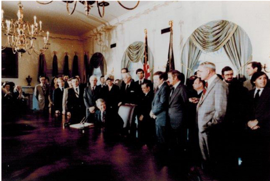
President Jimmy Carter signs the Nuclear Non-Proliferation Act in the Roosevelt Room, White House, March 10, 1978.