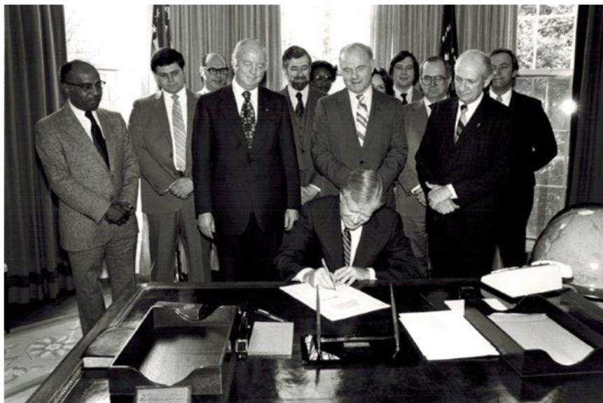
President Jimmy Carter signs the General Accounting Act in the Oval Office, April 3, 1980.