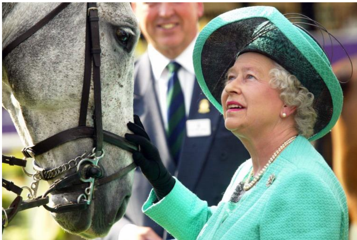
Queen Elizabeth II at the third day of the Royal Windsor Horse Show at Home Park in Windsor, England, on May 15, 2004.

It's been quite strange to have such deep feelings of loss as an American who's never set foot in the United Kingdom. But I've always felt drawn to Queen Elizabeth. I grew up watching her on television and knew who she was long before I knew the name of the U.S. president. Like the Cullinan diamond , which graces the top of the Sovereign's Scepter With Cross , Queen Elizabeth II was to so many people around the globe our rock and the brightest shining star on our planet.