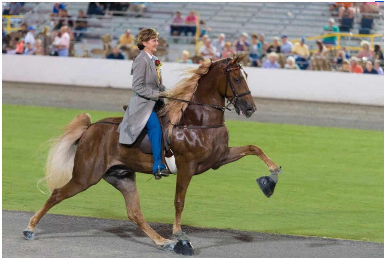
2014 Tennessee Walking Horse National Celebration.