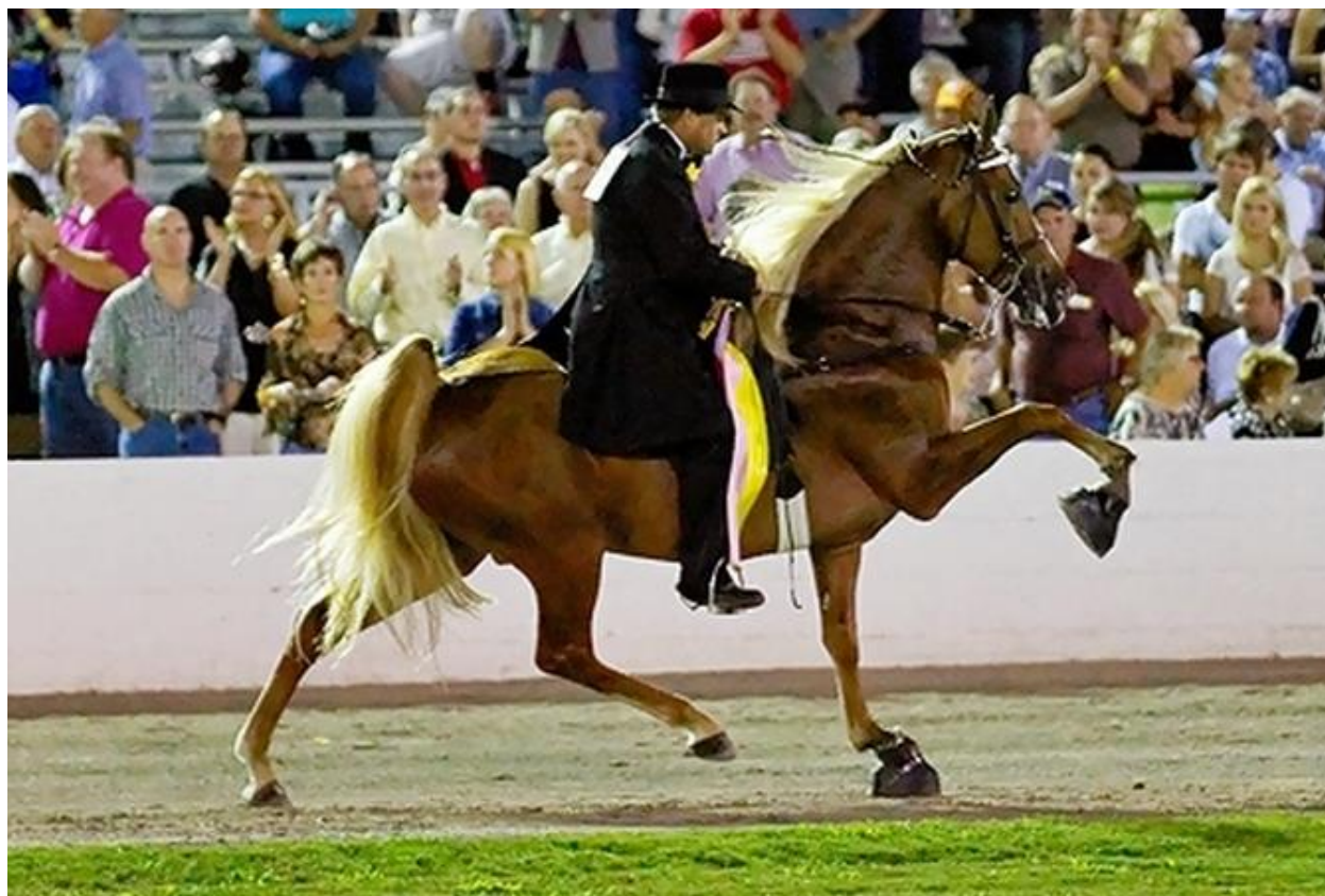
Horse performing with high stepping gait caused by soring. Randall Saxton

This week Animal Wellness Action (AWA), the Washington-based non-profit political advocacy group that worked diligently to pass the U.S. Senator Joseph D. Tydings Memorial Prevent All Soring Tactics (PAST) Act through the U.S. House in 2019, applauded U.S. House Appropriations Committee leaders for their inclusion of the highest-ever funding levels for enforcement of the Horse Protection Act (HPA) of 1970 in their Fiscal Year 2023 spending bill. The measure includes $4,096,000 in HPA funding, nearly six times the amount appropriated from in 2018.