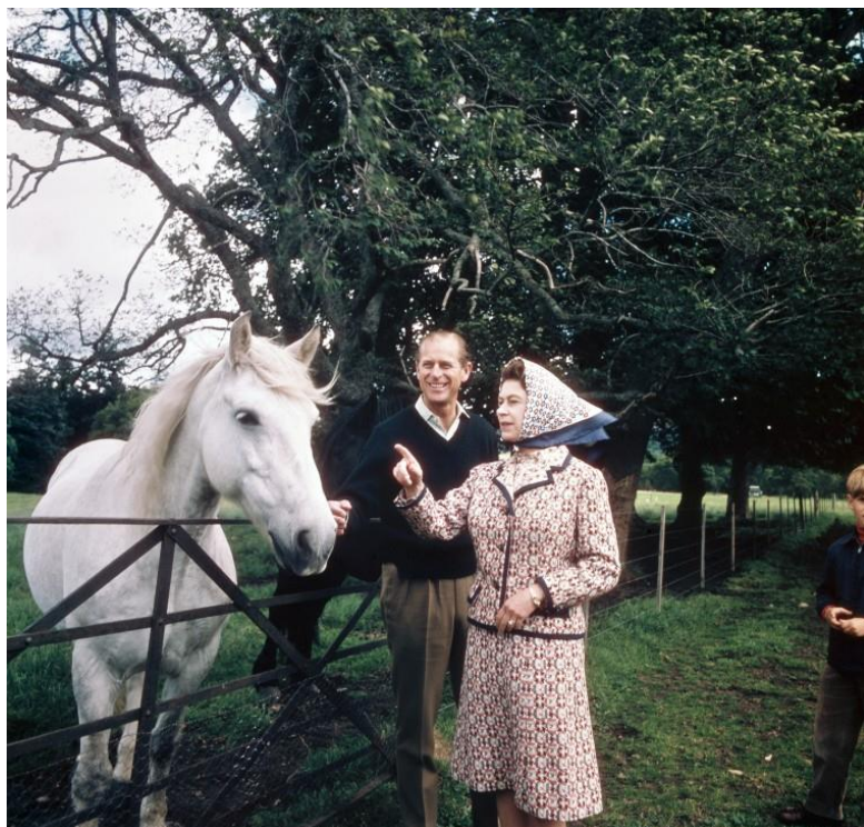
Queen Elizabeth II and Prince Philip visit a farm on the Balmoral estate in Scotland around September 1972 during their Silver Wedding anniversary year.