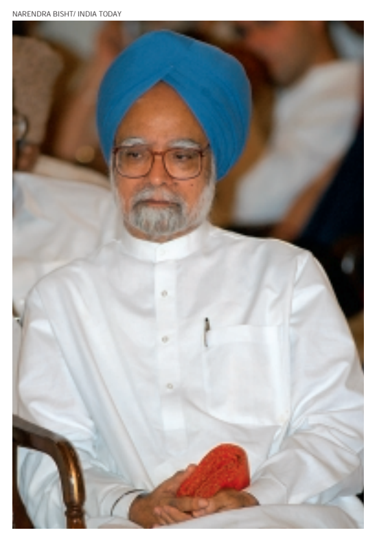
Dr. Manmohan Singh, the architect of India's economic reforms, is the country's new Prime Minister

The consequent understanding led to the first softening of the U.S. sanctions that had tightened against India following the tests. However, the Singh-Talbott talks floundered on one simple issue: India hesitated to sign the Comprehensive Test Ban Treaty (CTBT) after the CTBT ratification was voted