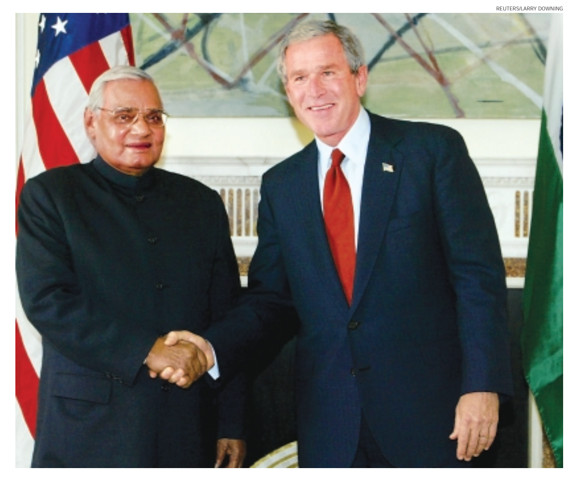
The vision of global peace and prosperity shared by President George W. Bush and Prime Minister A.B. Vajpayee led to the strategic partnership between the U.S. and India

The September 11, 2001 attacks spurred the new understanding between India and the U.S. to the next level. Soon after the attacks, India, which lost some 250 people of Indian origin in the carnage, promised unconditional help to the U.S. Government in the war on terrorism, even the use of Indian military facilities. During Operation Enduring Freedom in Afghanistan, the Indian Navy took up the important mission of escorting and protecting high value shipping through the Strait