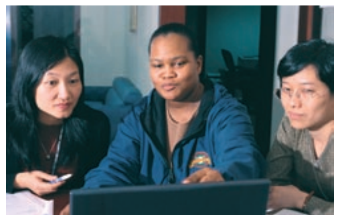
Timely data reporting and feedback are critical components for a strong national HIV/AIDS program.