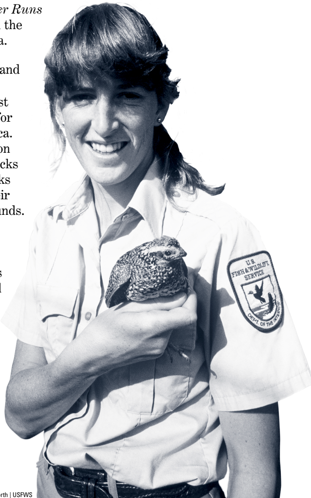
Hollingsworth | USFWS