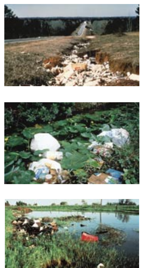
Litter remains a problem for the American landscape. The renewed Take Pride In America effort can help address this and other local environmental issues.

Take Pride in America was both a rallying call and a highly visible program to recognize and reward the extraordinary projects it supported and inspired. Under President Bush's leadership, we are re-launching and broadening Take Pride In America, to extend the benefits of volunteer service to public lands across the country.