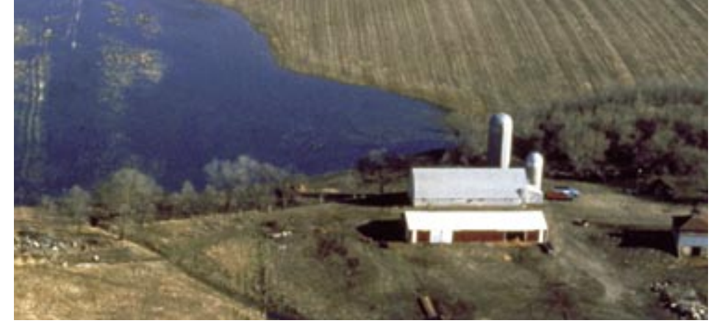
The new Take Pride In America will even recognize restoration efforts undertaken on private lands if there are significant public resource benefits.

President Bush has asked the American people to join together through their volunteer efforts to continue a legacy of service, and through Take Pride in America they can also establish a public lands and public places for future generations of Americans to enjoy and cherish.