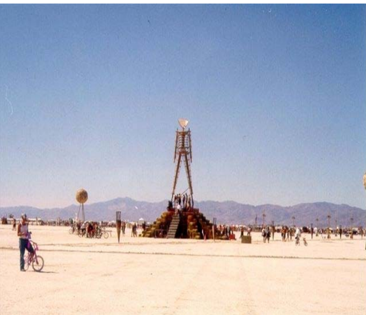
Burning Man before being burned, Black Rock/High Rock NCA, Nevada

Plan contact: Floyd Johnson, 435-636-3600