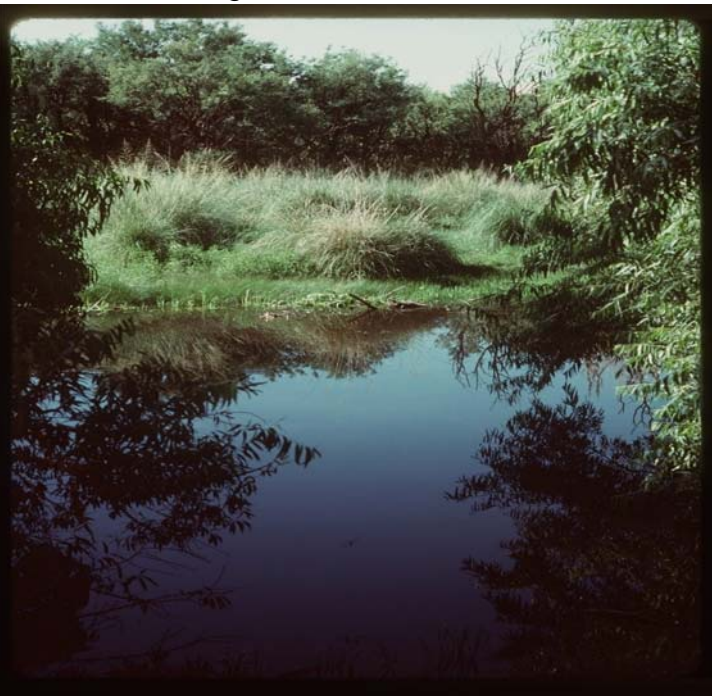
Las Cienegas NCA, Arizona