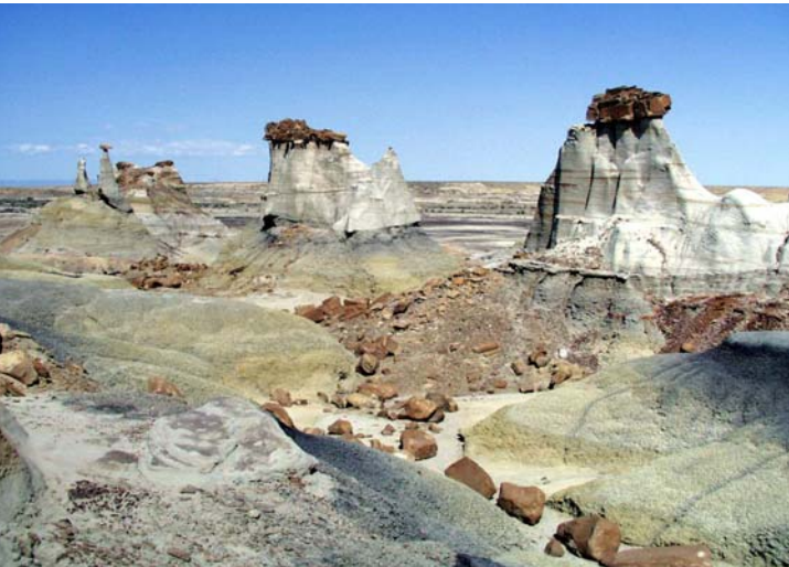
Wind carved rock towers in northern New Mexico's Bisti Badlands

BLM signed an approved Resource Management Plan for BLM's Las Cienegas National Conservation Area on July 25, 2003. The Approved RMP and Record of Decision sets in place land use decisions and management actions for the 42,000-acre area, designated by Congress in December of 2000, and also sets management goals for the larger Sonoita Valley Acquisition Planning District (SVAPD), which encompasses the