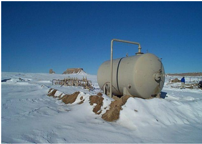
Natural gas liquids storage tank in winter, San Juan Basin, New Mexico

The ROD also commits the BLM to continue support of air quality monitoring, modeling, and future mitigation of emissions from natural gas