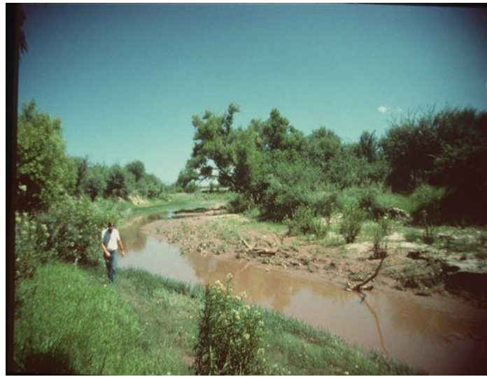
Las Cienegas NCA, in southeastern Pima County and northeastern Santa Cruz County, Arizona

Among the significant resources within the NCA are five of the rarest habitats in the American Southwest - Cienegas, cottonwood-willow riparian areas, sacaton grasslands, mesquite bosques and semidesert grasslands. The NCA also provides habitat for several endangered species, a site listed on the National Register of Historic Places, and two proposed wild and scenic river segments.