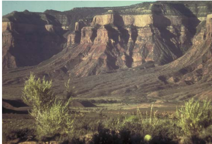
Cliffs of the Roan Plateau, northwest Colorado

Plan contact: Melissa Bristow, 760-251-4800