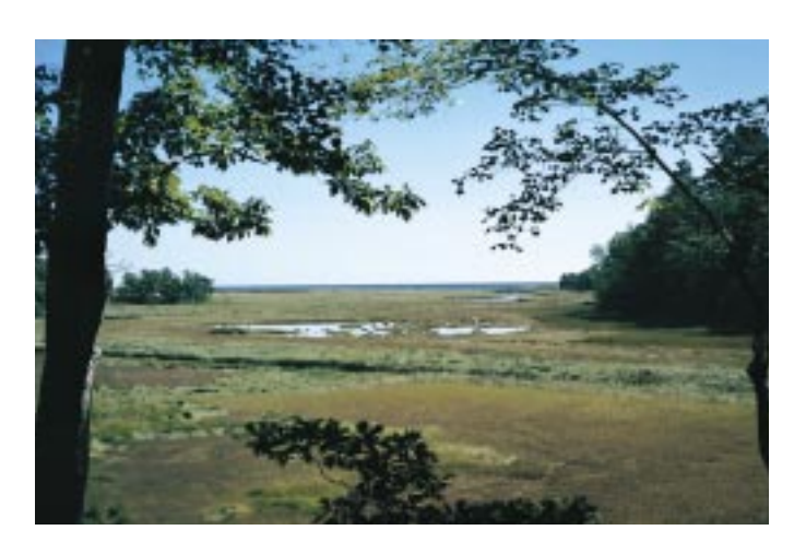
This tidal salt marsh provides a serene, protective habitat for a vast array of wildlife at the refuge.

The proximity of the refuge to the coast and its location between the eastern deciduous forest and the boreal forest creates a composition of plants and animals not found elsewhere in Maine. Major habitat types present on the refuge include forested upland, barrier beach/dune, coastal meadows, tidal salt marsh, and the distinctive rocky coast.