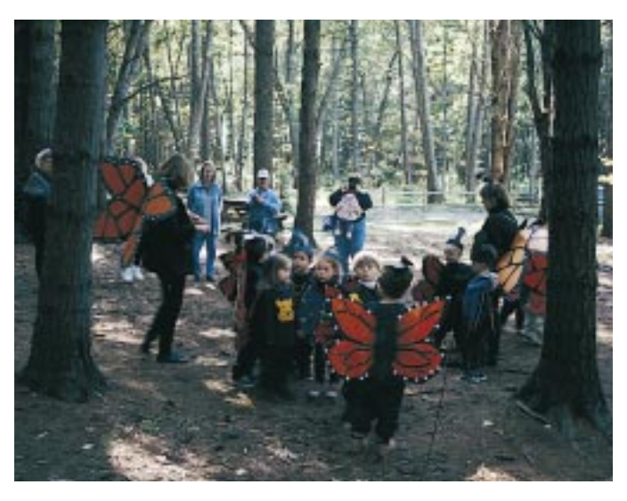
Children learn about the evironment in one of the refuge's educational activities.