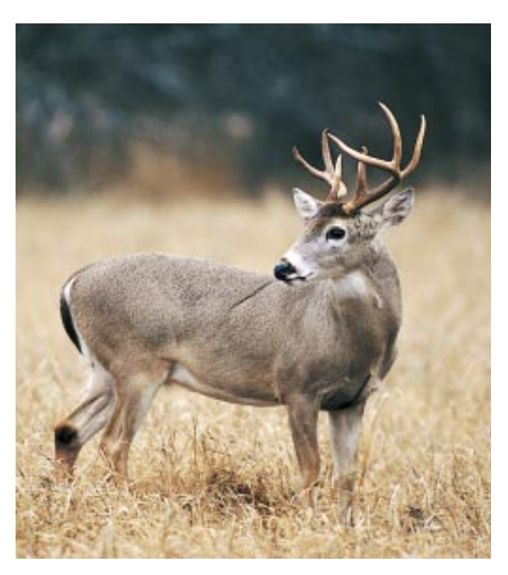
White-tailed deer.