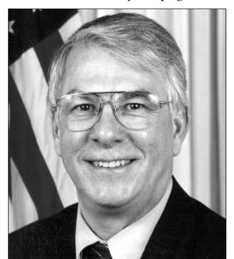
Chairman Donald Manzullo (R-Illinois, 16th Dist.)

rural. It also has a tremendous concentration of small businesses, with a heavy percentage in small manufacturing. The city of Rockford alone, with a population of about 150,000 people, is home to 950 factories.