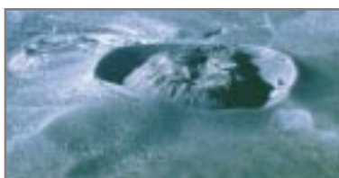
Much of the Long Valley area of eastern California is covered by rocks formed during volcanic eruptions in the past 2 million years. A cataclysmic eruption 760,000 years ago formed Long Valley Caldera and ejected flows of hot glowing ash, which cooled to form the Bishop Tuff. Wind-blown ash from that ancient eruption—which was more than 2,000 times larger than the 1980 eruption of Mt. St. Helens, Washington, that killed 57 people and caused several billion dollars in damage—covered most of the Western United States (inset map). The photo shows a volcanic cone (Panum Dome) formed by eruptions about 600 years ago at the north end of the Mono Craters. The most recent volcanic eruptions in the area occurred in Mono Lake sometime between the mid-1700's and mid-1800's.