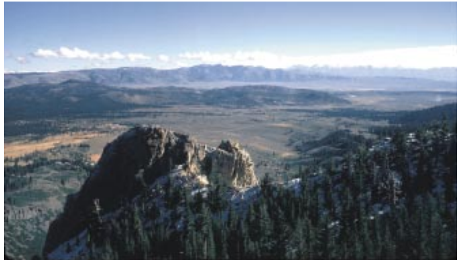
Long Valley Caldera in eastern California (here viewed from its southwest rim toward its northeast rim on the horizon 18 miles away) was formed about 760,000 years ago in a violent volcanic eruption that blew out 150 cubic miles of magma (molten rock) from beneath the Earth's surface. U.S. Geological Survey scientists are tracking continuing dome-like swelling centered in the low forested hills in the middle of the caldera. This swelling affects more than 100 square miles and is caused by magma rising beneath the Earth's surface.

E arth scientists have monitored geologic unrest in the Long Valley, California, area since 1980. In that year, following a swarm of strong earthquakes, scientists discovered that the central part of the Long Valley Caldera had begun actively rising. Unrest in the area persists today. The USGS continues to provide the public and civil authorities with current information on the volcanic hazard at Long Valley and is prepared to give timely warnings of any impending eruption.