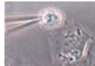
The nanoprobe can penetrate and be safely removed from a living cell.

Researchers at DOE's Oak Ridge National Laboratory have developed a "nanobiosensor" that allows scientists to physically probe inside a living cell without destroying it. As