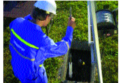
Every three months or even more often, technicians sample JPL area groundwater as part of NASA's ongoing effort to characterize the plume of chemicals it is cleaning up.

Since the groundwater is hundreds of feet below the surface in this area, the new monitoring wells will be drilled down to about 1000' feet. Drilling of deep monitoring wells is a costly process, so the location for each well is carefully considered in order to gain the most useful information on the groundwater.