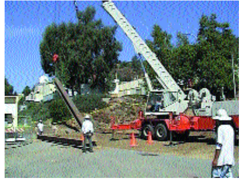
Construction activity for the treatment facility at the JPL site in July, 2004.

The treatment plant, located in a portion of a parking lot on JPL, will remove volatile organic compounds (VOCs) and perchlorate found in groundwater directly beneath JPL, the area where the highest concentrations of the chemicals are located. Treating groundwater at the chemical source area will help stop chemicals from spreading into the groundwater beyond the JPL boundary and reduce the duration of treatment at the City of Pasadena and Lincoln Avenue Water Company wells.