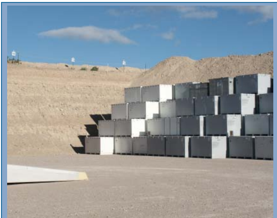
Low-level waste boxes are methodically stacked in a numbered grid system, which aids in waste tracking.