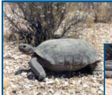
Desert Tortoise (top) Baby Kit Fox (middle) Wild Mustang (bottom)