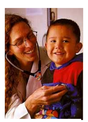
Mission— Improve Health

The special character of the Indian health system arises from a combination of its unique