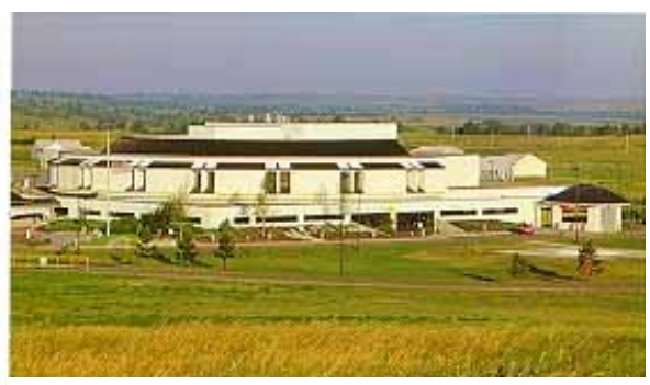
Rosebud Health Facility in the Great Plains of South Dakota

Improving access has also meant constructing health care facilities on remote reservations. Many Indian communities are located in isolated areas where inhospitable climate, impassable roads, and populations spread over many miles create major challenges. Often, IHS is the only source of health care. While some Indian communities have modern IHS hospitals and ambulatory facilities, the average age of IHS facilities is 32 years, with some older than 60 years. Over one-third need replacement to increase clinic space and many need substantial modernization. It is difficult to properly support current medical practices in older facilities that were built before the modern emphasis on ambulatory care.