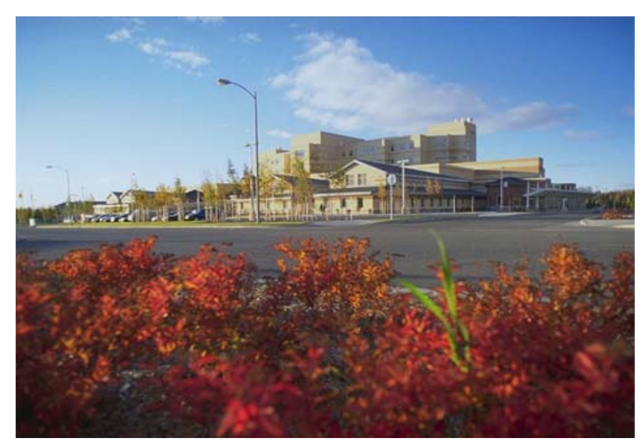
Alaska Native Medical Center, Anchorage Alaska

"Yesterday, I had a chance to attend several tribal meetings. I was greatly moved sitting in a meeting with the Native corporations of Alaska. They presented a video of what they are doing with their health care programs and the Alaska Native Medical Center, which was transferred from the Indian Health Service to the Native corporations just about a year ago. Who would have thought 50 years