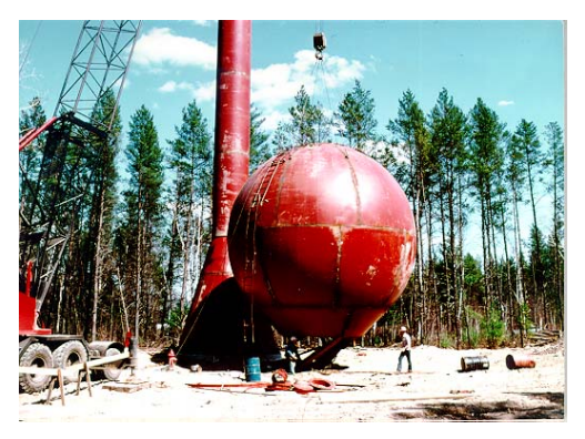
Community Water Supply Project

tribes. The agency's 15,000 employees include 921 physicians, 303 dentists, 2,729 nurses, 411 pharmacists, 347 engineers, and 155 sanitarians.