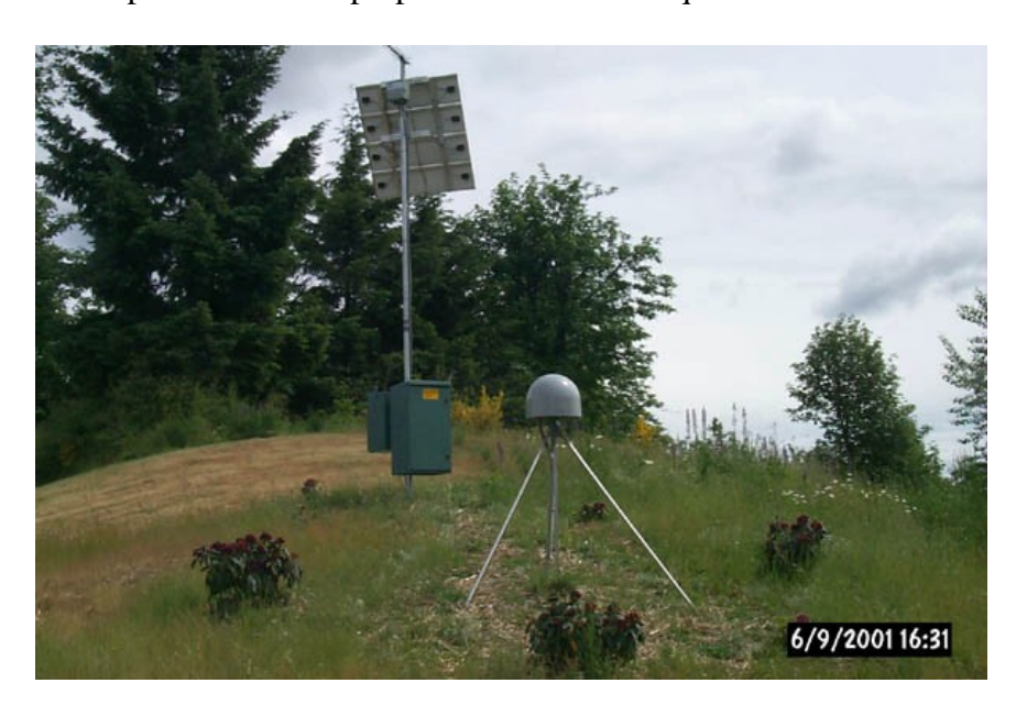
PANGA GPS base station on PuPu Point, DNR property