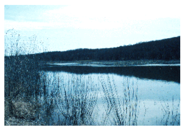
Finished wetland project.