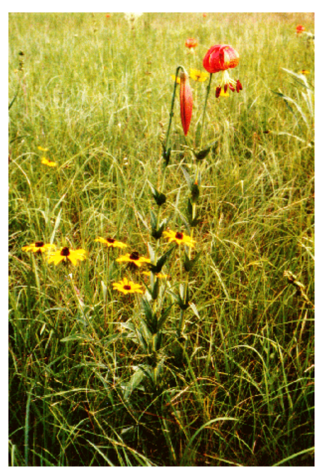
Michigan Iily and black-eyed Susan.