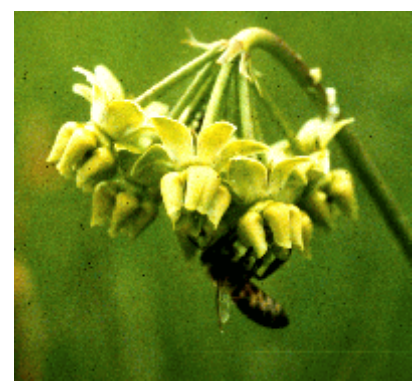
Federally threatened Meads milkweed.

compose this unique plant community. Over 250 bird species, 60 species of mammals, 35 species of reptiles, amphibians, and countless species of insects, all form this rich tapestry of life that we call the tallgrass prairie.