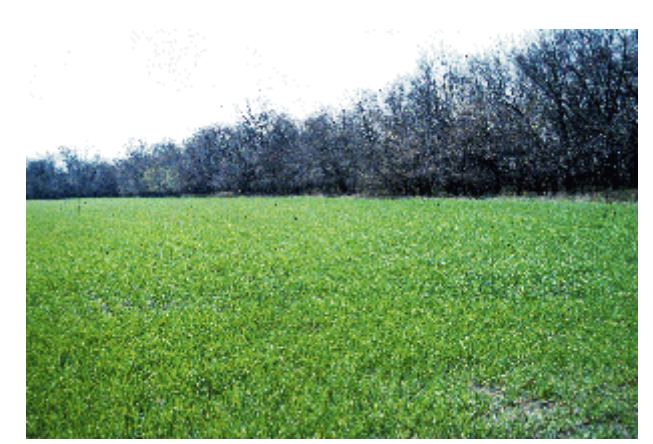
Pre-work photo of wetland site.