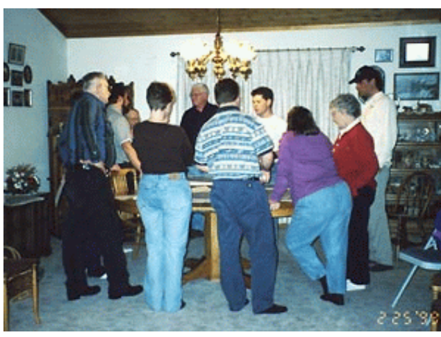
Friends of Grave Creek.

Montana Department of Natural Resource Conservation The Nature Conservancy Bonneville Power Administration Plum Creek Timber Company