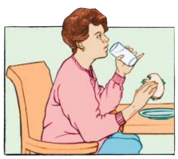
Sipping liquids with your meals will make eating easier.