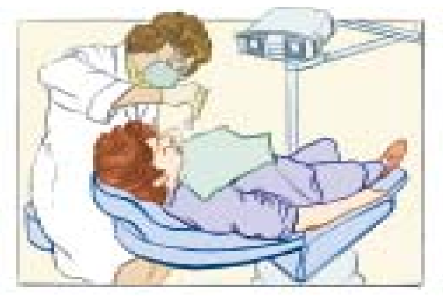
The dentist will do a complete exam.