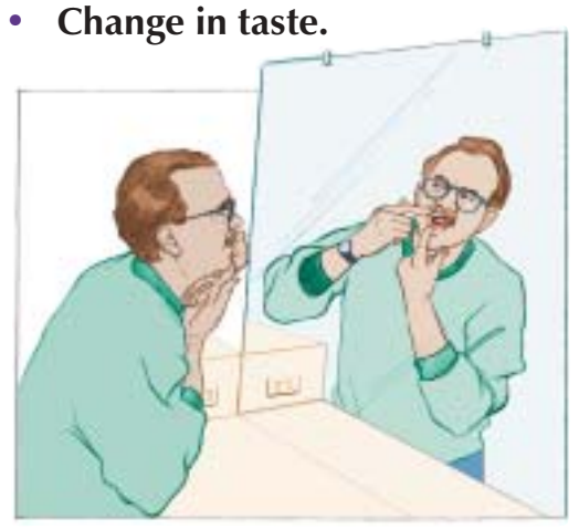
You can see or feel most of these problems. Check your mouth every day.