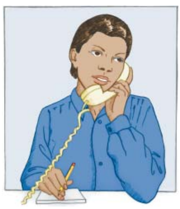
Call your cancer doctor or dentist if you have any mouth problems.