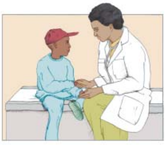
Your child has special dental needs.

Before chemotherapy begins, take your child to a dentist. The dentist will check your child's mouth carefully and pull loose teeth or those that may become loose during treatment. Ask the dentist or hygienist what you can do to help your child with mouth care.