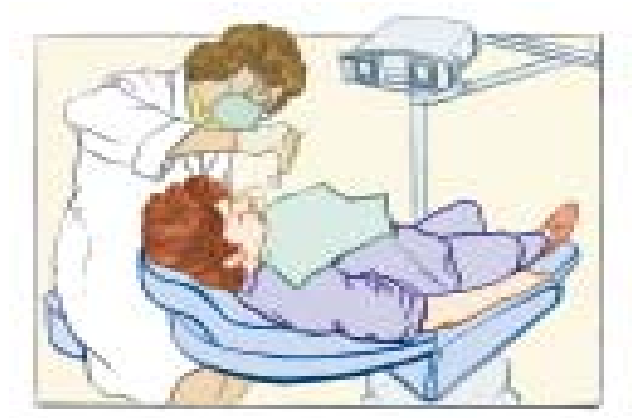
The dentist will do a complete exam.