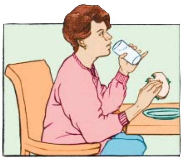
Sipping liquids with your meal will make eating easier.