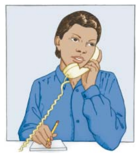
Call your cancer doctor or dentist if you have any mouth problems.