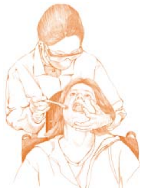
Positioning for treating a patient in a wheelchair. Note the support a sliding board can provide. Sliding or transfer boards are available from home health care companies.

UNCONTROLLED BODY MOVEMENTS can jeopardize safety and your ability to deliver dental care. Pay special attention to the following: