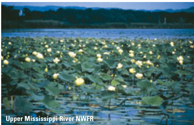
Upper Mississippi River NWFR