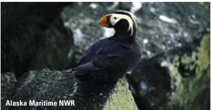
Alaska Maritime NWR

Additional detailed information can be found in the "Report of Lands Under Control of the U.S. Fish & Wildlife Service as of September 30, 2003" (see our website address on back of brochure).