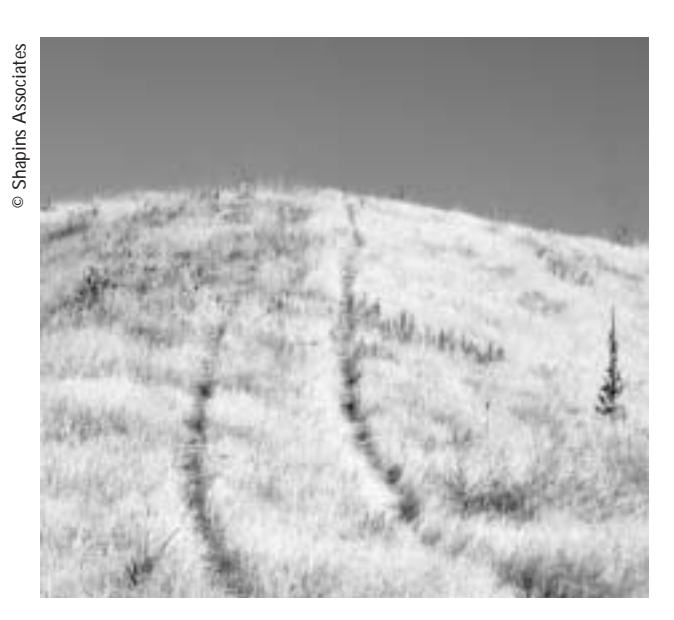
Future trail corridor leading to the Woman Creek overlook.