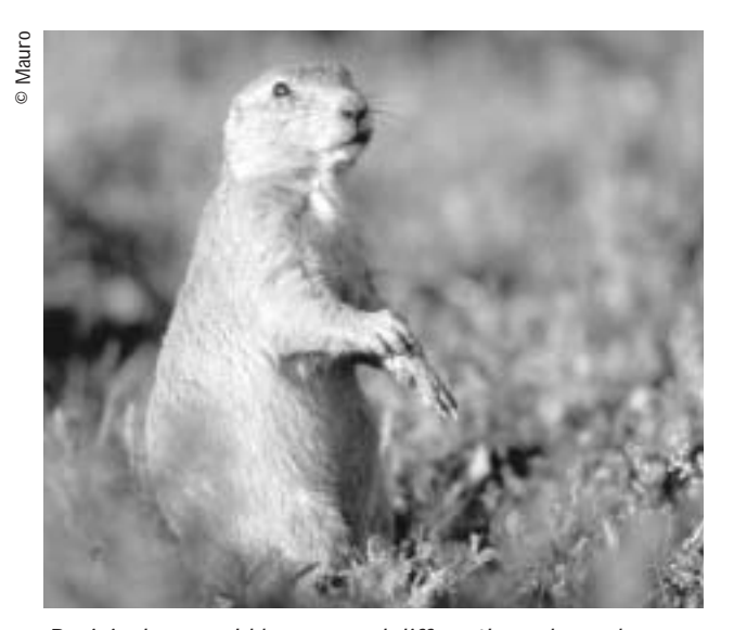
Prairie dogs would be managed differently under each alternative.

Alternative C would promote the overall goal of restoring the Refuge environment to pre-settlement conditions. In Alternative C, the Lindsay Ponds on Rock Creek, which currently provide habitat for the reintroduced fish species, would be removed and Rock Creek restored.