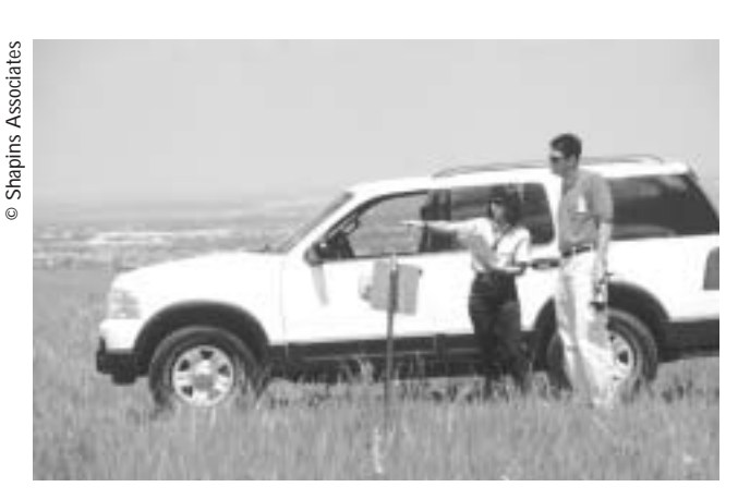
Refuge access would be limited to guided tours in Alternatives A and C.

dependent public uses. The Refuge provides opportunities for the public to experience the unique xeric tallgrass prairie, upland shrub, wetland habitats and learn about the site's history and the NWRS. Trails and overlooks would be designed to allow visitors to experience the diverse areas of the site and expansive views of the mountain backdrop and the Denver/Boulder metropolitan area. Visitors would be able to hike off trail in the southern portion of the Refuge during specific times of the year (October-April). Limiting off trail use to the late fall and winter would limit impacts to ground nesting birds and deer fawning in the uplands.