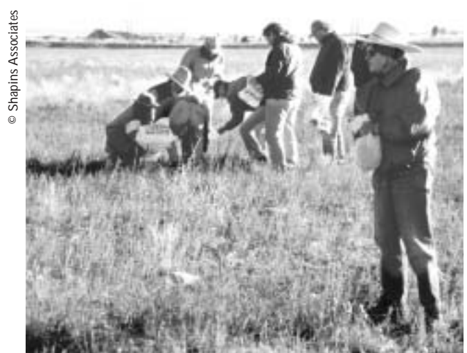
Volunteers would help with restoration activities such as seed collection.