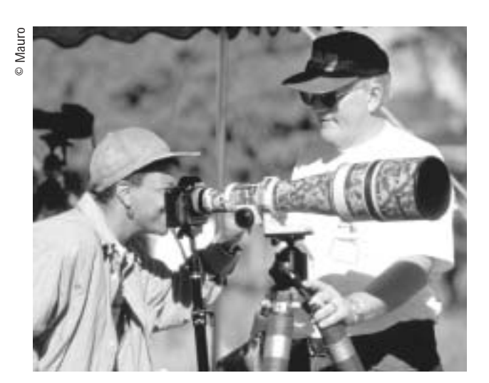
Wildlife observation is a priority wildlife-dependent public use.

In all alternatives, access to the site would be obtained via a two-lane road off of Highway 93. In Alternatives A and C, access would be pre-arranged with the Service and the visitor experience would be limited to a guided tour with Refuge staff. In Alternatives B and D, the access road would direct visitors to orientation information, trailheads and parking areas.