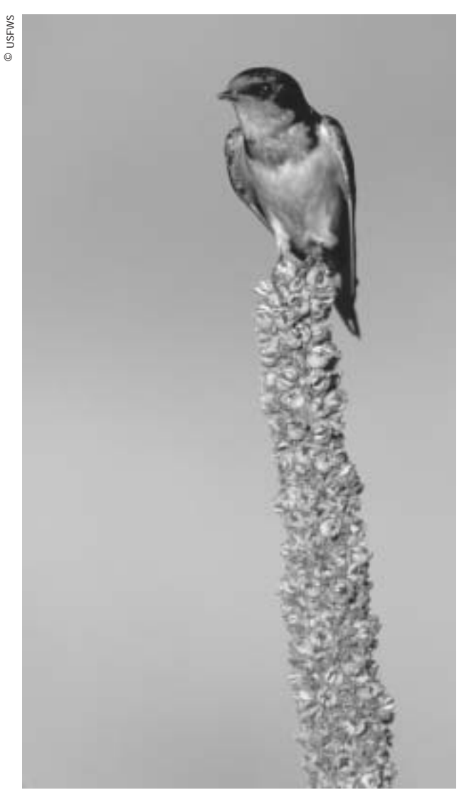
Viewing blinds and overlooks would facilitate wildlife observation and photography.

Rationale: Same as Alternative B plus a staffed visitor center would be located in an existing disturbed area where it would not fragment wildlife habitat. The facility would allow for more visitor contact and provide a central location for information dissemination and interpretation.