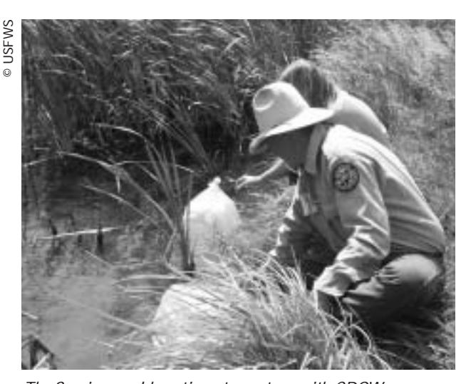
The Service would continue to partner with CDOW.

Rationale: The Service would establish a partnership with CDOW and afford the agency opportunities to supplement the Service's limited habitat and wildlife conservation programs. The Service would cooperate with CDOW on potential species reintroductions. The Service