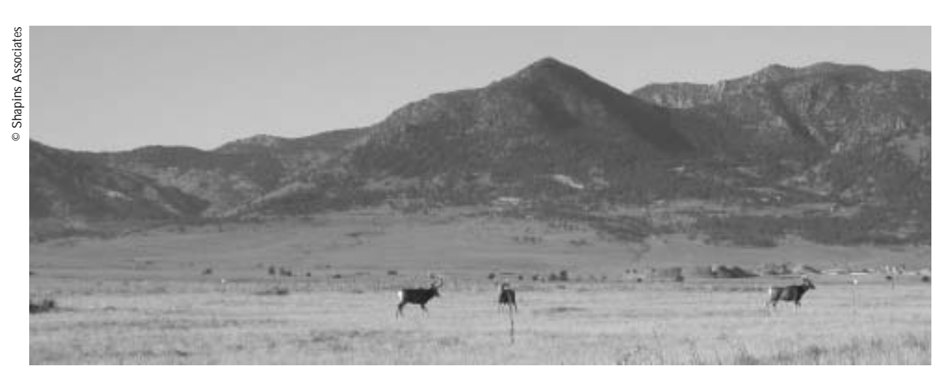
The Front Range mountain backdrop provides a beautiful setting for wildlife observation.

Research opportunities would focus on the integration of public use into the Refuge environment and interactions between wildlife and visitors. Partnerships would be sought with various public agencies to help sustain Refuge goals and preserve contiguous lands. The Service also would work with local communities and tourism organizations to promote wildlife-dependent public uses on the Refuge (Figure 7).