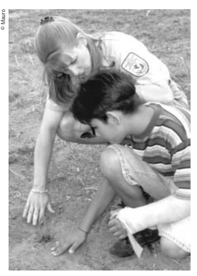
Interpretive programs in Alternatives B and D would allow the public learn about prairie restoration.