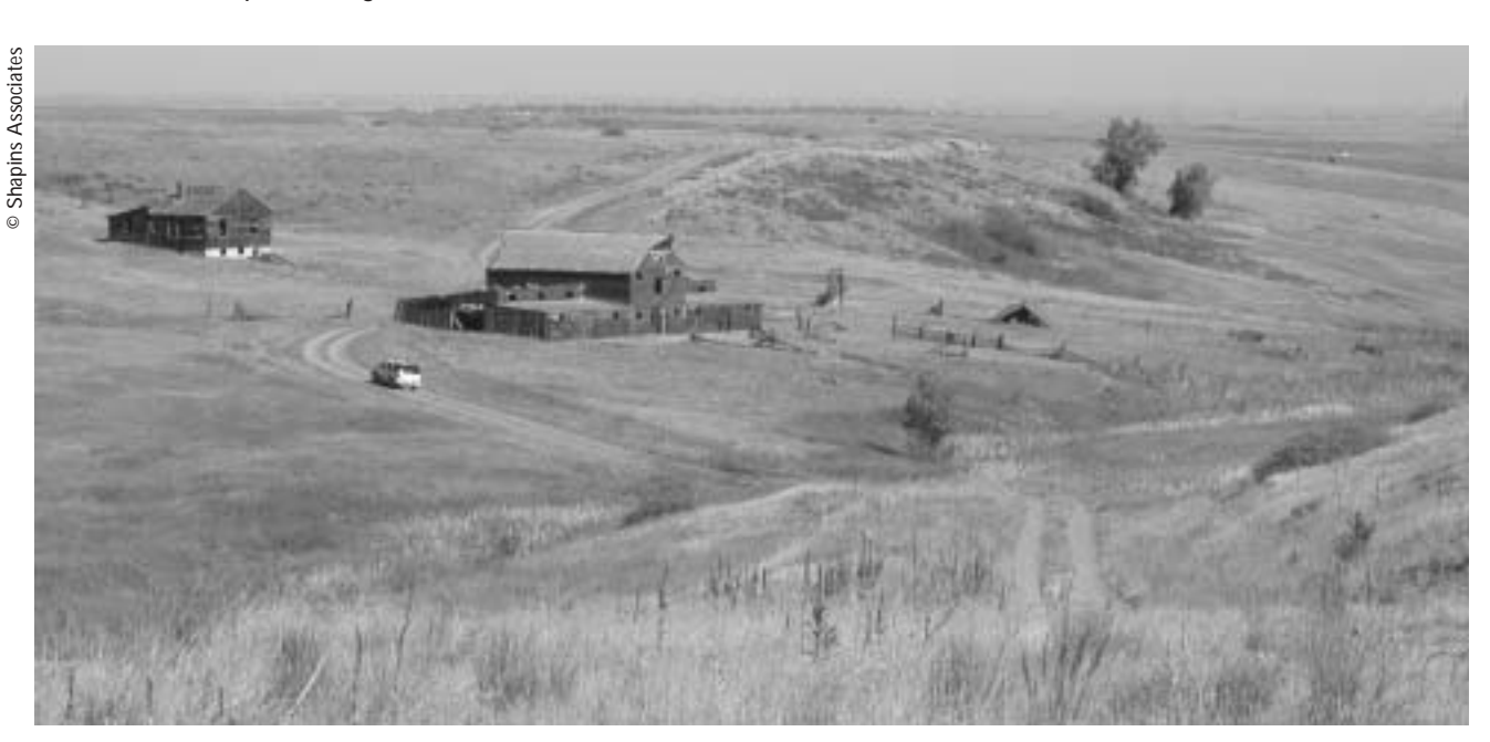
A future trail would follow the road corridor down to the Lindsay Ranch barn in Alternatives B and D.

Other than providing a portable restroom, no public use facilities would be developed. Visitation to the Refuge would be by arrangement only and visitors would most likely be taken on auto tours along the access roads.