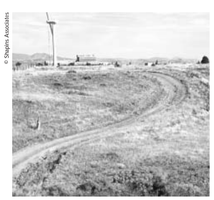
A pedestrian trail would follow the road corridor along the Refuge's western boundary.

Among the alternatives, Alternative D would offer the greatest amount of wildlife-dependent public uses. The Refuge would be open to the general public about 6 months to 1 year after Refuge establishment, although it is likely that some of the facility development and programming would be phased in over the course of the