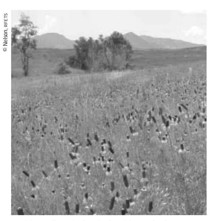
Prairie coneflower in the mixed prairie grassland.

Early in the planning process, the planning team identified three management zones that correspond to general vegetation communities at Rocky Flats. These management zones are xeric tallgrass prairie, wetlands and riparian corridors and mixed prairie grasslands. These management zones were developed to organize management concepts and provide direction to the objectives and strategies under each alternative.