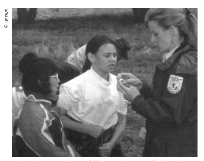
Alternatives B and D would have environmental education programs.

The goal of the interpretive programs at the Refuge is to inform the public about the Rocky Flats site, educate about resident wildlife and their habitats and cultivate a stewardship ethic. Committed to fostering an appreciation of the Refuge's natural resources, the Service developed interpretive themes that focus on wildlife, wildlife habitat and the site's history. Providing the public with interpretive information would enhance the public's understanding of their surrounding natural environment and increase support