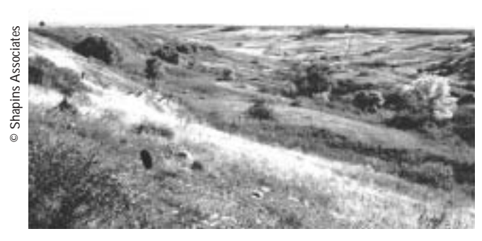
A pedestrian trail would overlook the Rock Creek drainage.

All multi-use trails would be open to equestrian and biking use. Off-trail use would be permitted seasonally in the southern half of the Refuge. Off-trail use would provide visitors with increased opportunities to view wildlife and to explore the grasslands.