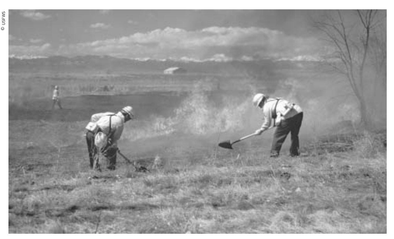
Prescribed burning would occur in designated areas outside of DOE-retained lands in Alternatives A, B, and C.