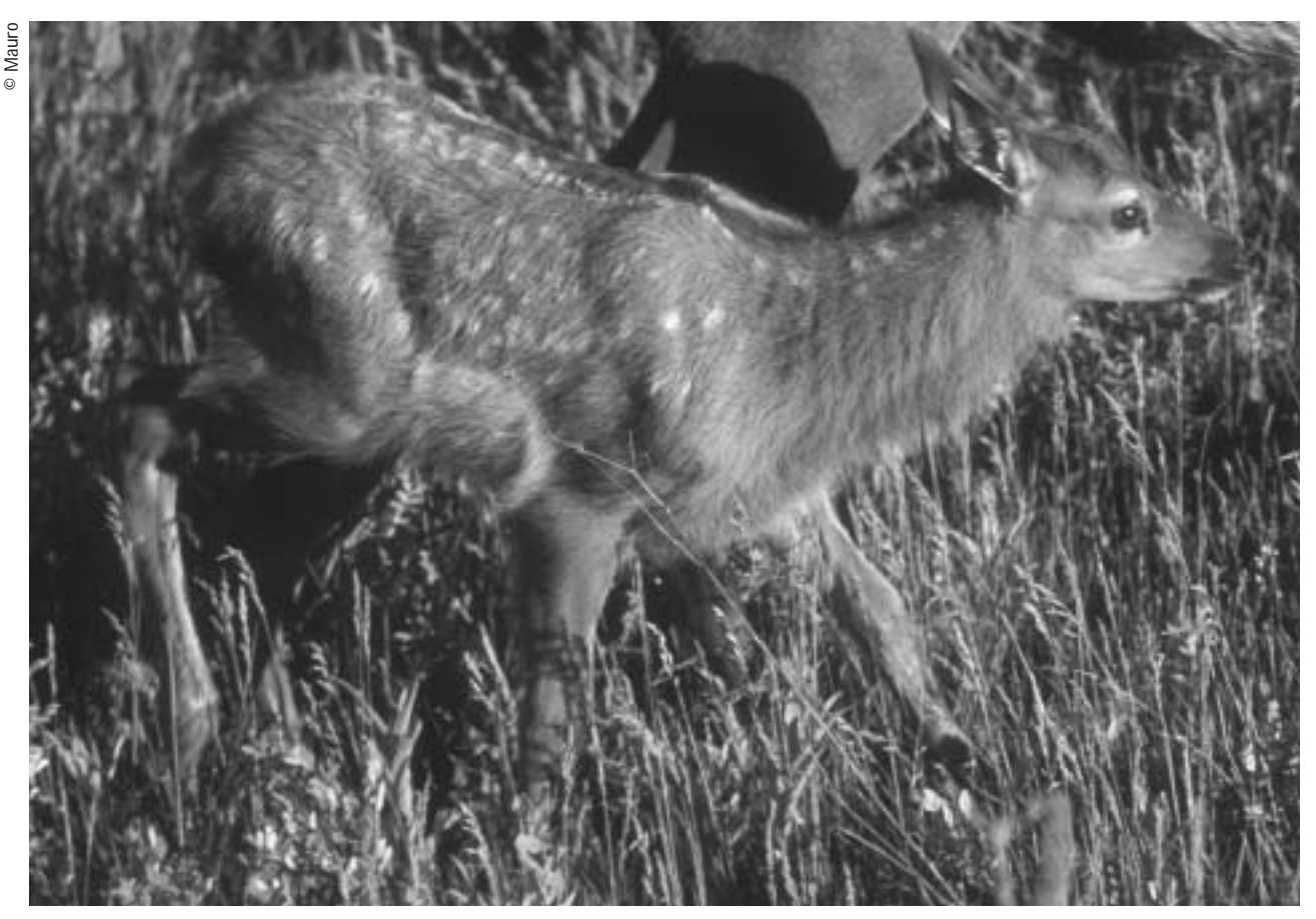
Limited hunting, wildlife observation and photography would be included in Alternatives B and D.

observation, photography, interpretation and environmental education. The public use activities would be carefully managed to avoid harmful impacts to wildlife and their habitat. Because the Service would focus on restoration and facility development during the first 5 years of Refuge operation, most of these activities would not be instituted until the Refuge is fully open to the general public (by year 6).