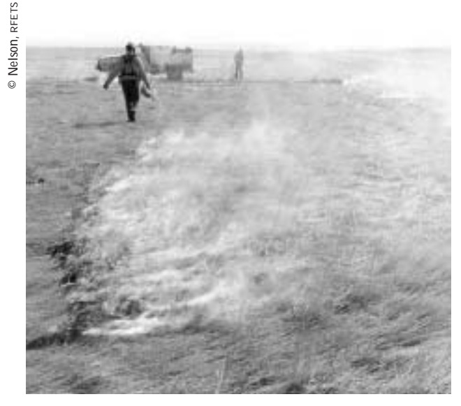
Prescribed fire would be used as a management tool in Alternatives A, B and C.

IPM involves techniques that simulate the processes that contribute to the integrity of the ecosystems and can be