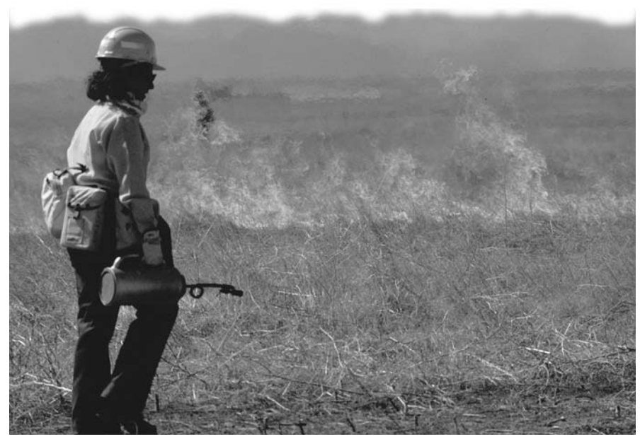
Burning helps maintain the ecological health of the prairie