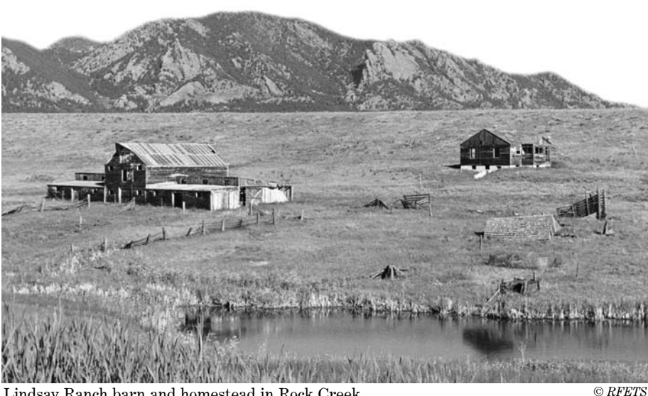
Lindsay Ranch barn and homestead in Rock Creek

For the future visitor to Rocky Flats, the Refuge location is remarkable because it offers striking views of both the Rocky Mountains and the Denver skyline. With nearly 50,000 acres of publicly owned land surrounding Rocky Flats, the Refuge is also a key component of the Metropolitan region's open space network. The substantial mass of contiguous land encompassing the Refuge will provide wildlife with a habitat corridor that extends from the Continental Divide to the prairie.