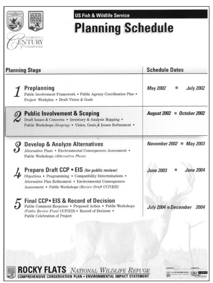
The three-year CCP/EIS schedule

As the planning process unfolds over the next three years, the Service will return to the draft vision statement outlined in this document. While the statement today seems like a fair expression of what the Refuge will be like in the future and what it will offer visitors and wildlife, the vision of Rocky Flats NWR may continue to evolve over time. Public comments, innovative ideas and new partnerships will continue to shape the refinement of the vision statement and, in turn, guide the development of the CCP.