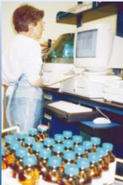
Dissolved organic carbon samples are analyzed on an ultraviolet persulfate total organic carbon analyzer.

The high volume of analyses, accuracy and reliability, low-detection levels, and new applied research mark the NWQL as a unique part of the USGS. At present (2001), about 60,000 samples collected with USGS field protocols are sent to the NWQL each year, making it one of the largest environmental water-testing laboratories in the United