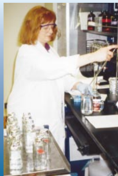
A spike is pipetted into a distilled water sample in the carbon lab.

Organic Chemistry. State-of-the-art techniques are used to separate and analyze complex organic compounds present in