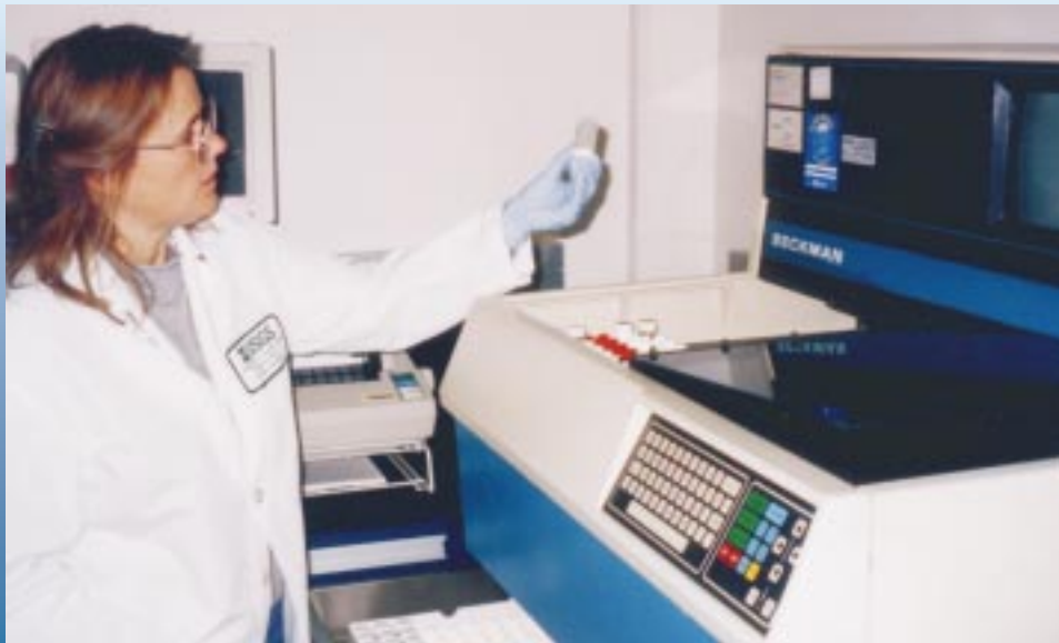
Sample vials of ambient water in a scintillation cocktail are loaded into a liquid scintillation system for radon detection.

water, sediment, and tissue samples. Examples of compounds determined include explosives, fossil-fuel residues and emissions, pesticides and their degradates, pharmaceuticals, chlorophyll, chlorinated solvents and other volatile compounds, polychlorinated biphenyls (PCBs), phenols, phthalates, and other chemicals used in industrial processes. Instrumentation includes carbon analyzers, liquid and gas chromatographs, and mass spectrometers.