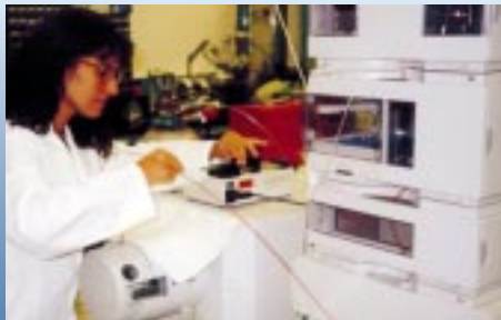
Sample extracts are prepared for loading into autosampler for analysis by high-performance liquid chromatography.

properties are determined in water, sediment, and tissue samples. Examples of physical properties include color, pH, specific conductance, and turbidity. Instrumentation includes graphite furnace, atomic absorption spectrophotometer, ion chromatograph, colorimeter, inductively coupled plasma, and inductively coupled plasma–mass spectrometer.