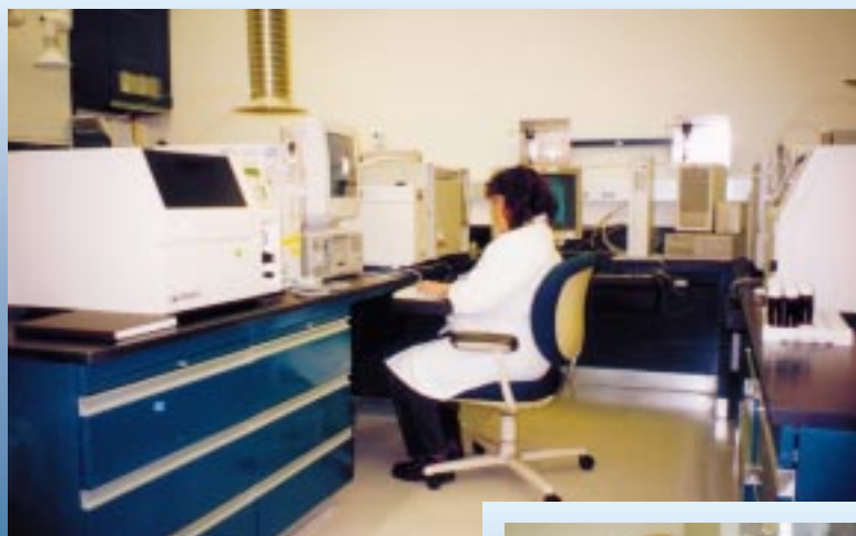
Gas chromatographic mass spectrometer is set up for determining presence and concentrations of volatile organic compounds.

Analytical Services. The NWQL determines organic and inorganic constituents in samples of ground and surface water, river and lake sediment, aquatic plant and animal tissues, and atmospheric precipitation collected in the United States and its protectorates. The NWQL determines about 650 unique constituents in multiple matrices; the majority of