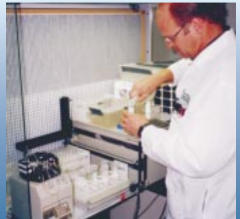
Samples of inorganic trace elements are prepared for analysis by inductively coupled plasma-mass spectrometry.

in accuracy (low bias and low variability) for present methods. Recent new methods, for example, have been developed to determine polar pesticides and pesticide degradates (compounds that are