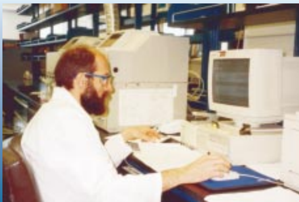
Chemist analyzes data from liquid chromatograph.

Audits. The Branch of Quality Systems audits the NWQL to ensure that services comply with USGS