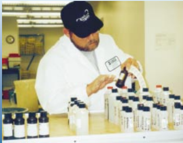
Sample login area is conveniently located near shipping and receiving. Samples are unpacked and bar-code labels are applied for identification and tracking.

States. More than 2.3 million individual chemical determinations are made each year from these samples through agreements with USGS offices relating to national assessment and cooperative programs with other Federal, State, and local agencies. Analytical work destined for the NWQL flows through these USGS offices throughout the United States.