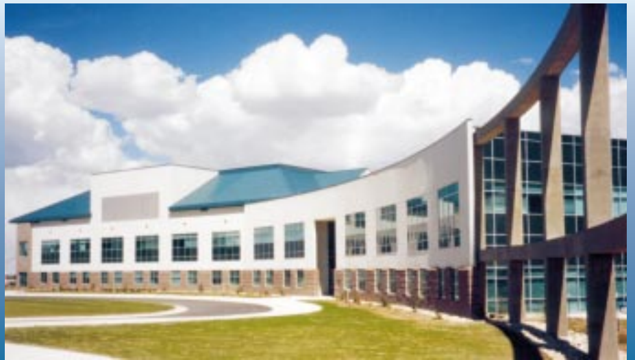
Front view shows north wing of the National Water Quality Laboratory, Denver, Colorado.

The NWQL has a highly trained and talented work force, and a history of quality and leadership in development of analytical methods for water, sediment, and tissue. The NWQL offers comprehensive services through a modern facility designed for efficient and safe operation. It was