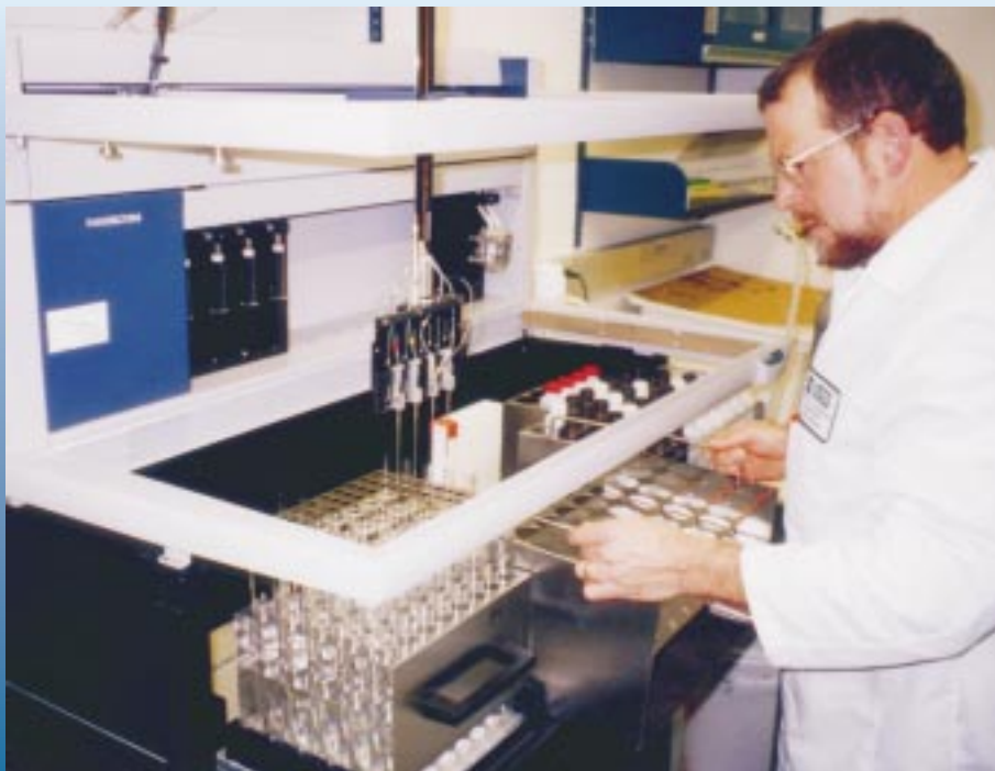
Robotic liquid sample-handling system is configured for automatic, simultaneous preparation of digests for dissolved Kjeldahl nitrogen and dissolved low-level phosphorus determinations.

Performance Evaluation. The NWQL demonstrates exceptional performance in testing for a wide range of constituents in various sample matrices by participating in interlaboratory and certification programs administered by third-party agencies. The NWQL takes part in national and international performance evaluation studies coordinated by the following organizations: Environment Canada, National Environmental Laboratory Accreditation Program, National