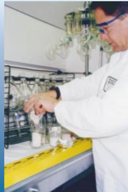
Fish-tissue samples are prepared for Soxhlet extraction.

The Methods Research and Development Program (MRDP)