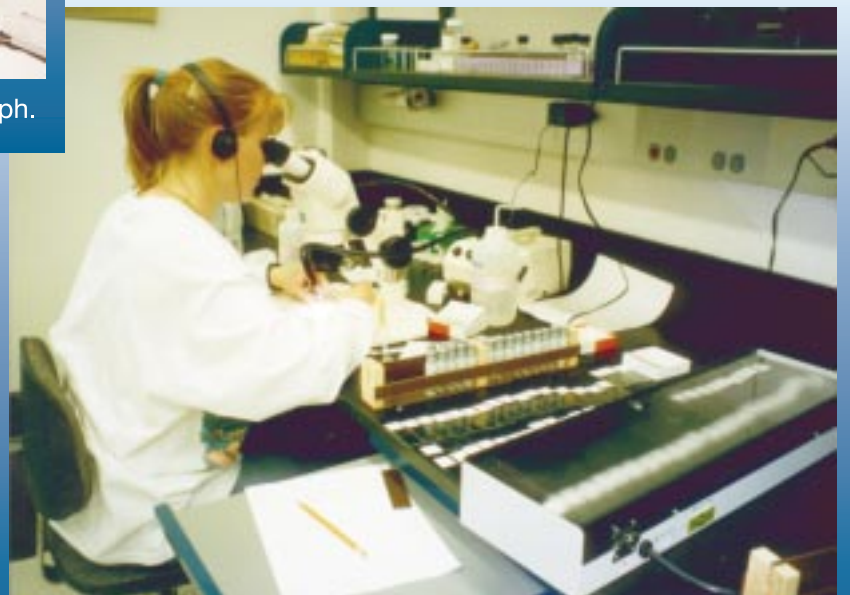
Biological technician prepares slides of invertebrates for identification.

Consistency. Validating the consistency of analytical data nationwide is one goal of the NWQL's participation in the NELAP process. Consistent data lend credence to the data for all samples, whether collected as one-time “grab” samples or gathered as multiple