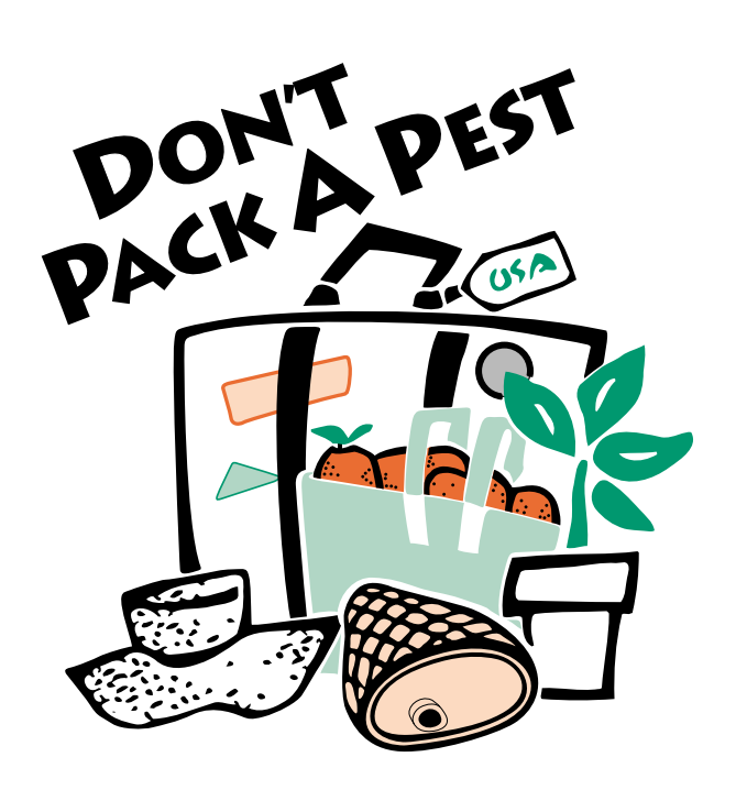
The U.S. Department of Agriculture (USDA) prohibits discrimination in all its programs and activities on the basis of race, color, national origin, sex, religion, age, disability, political beliefs, sexual orientation, or marital or family status. (Not all prohibited bases apply to all programs.) Persons with disabilities who require alternative means for communication of program information (Braille, large print, audiotape, etc.) should contact USDA's TARGET Center at (202) 720–2600 (voice and TDD).

To file a complaint of discrimination, write USDA, Director, Office of Civil Rights, Room 326–W, Whitten Building, 1400 Independence Avenue, SW, Washington, DC 20250–9410 or call (202) 720–5964 (voice and TDD). USDA is an equal opportunity provider and employer.