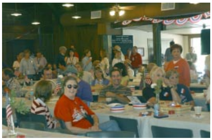
It's fun and fellowship for these Science Directorate employees.