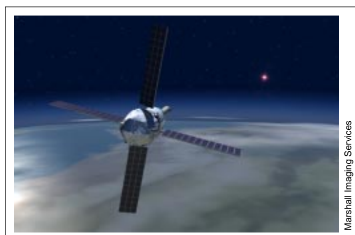
An artist's concept of Gravity Probe B in orbit.