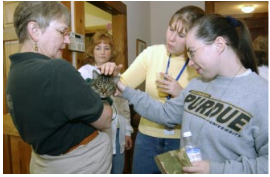
Marshall team members meet 'therapy' partner

Observations by NASA's Uhuru X-ray satellite in the 1970s showed that globular clusters seemed to contain a disproportion-