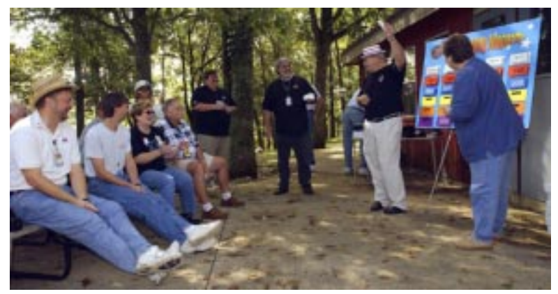
Marshall Safety Action Team members, right, organize a rousing game of "Safety Jeopardy."