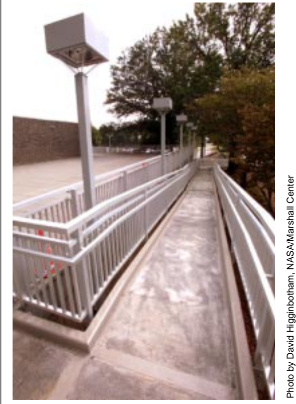
New handicap ramp open A new handicap ramp is open leading from the visitor parking lot to the front of Bldg. 4200.

The writer, an employee of ASRI, is the Marshall Star editor.