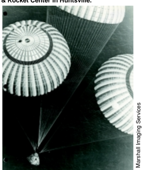
Apollo 17 moments before splashdown in the Pacific Ocean.