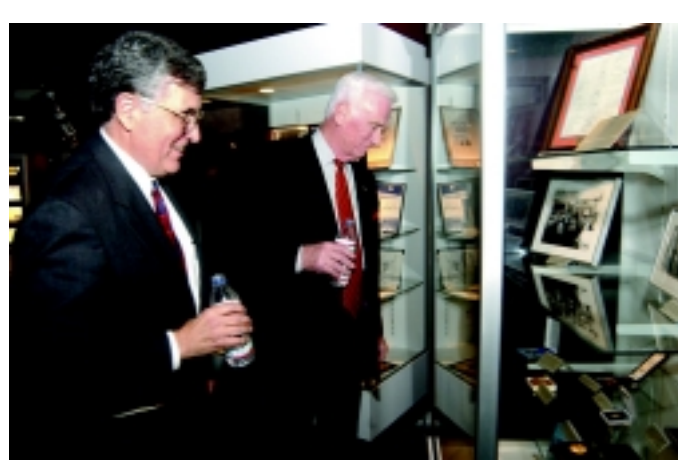
Schmitt and Cernan view memorabilia in Heritage Gallery in Bldg. 4200 at the Marshall Center.