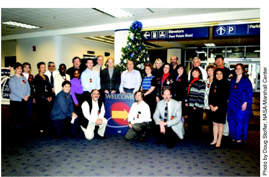
NASA team members attending the SOLAR training workshop in Huntsville.

For more information on SOLAR, contact Merecedes Sironi at 1-858-495-0508.