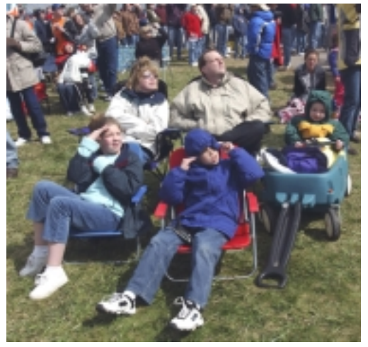
The Reynolds family of Harvest enjoys the show.