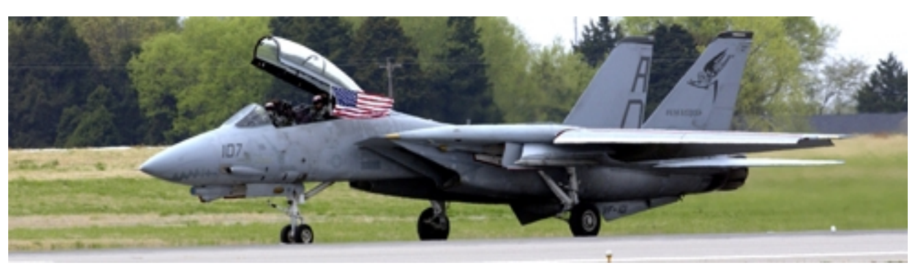
A Navy F-14 Tomcat rolls down the runway while a crew member shows the colors.