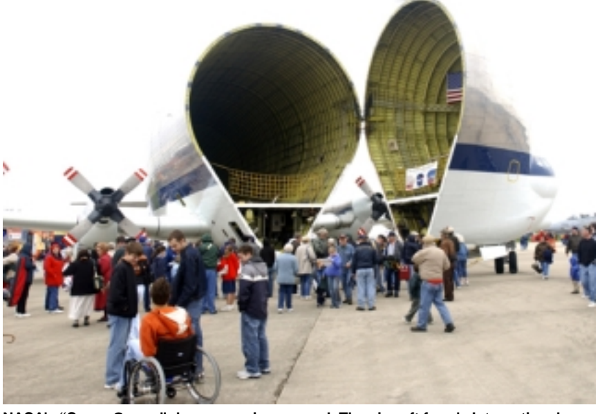
NASA's "Super Guppy" draws a curious crowd. The aircraft ferry's International Space Station modules to Kennedy Space Center when they are ready for launch.