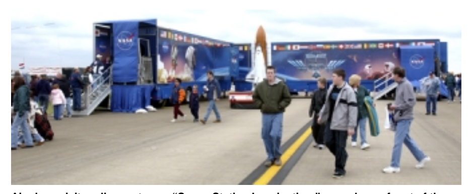
Air show visitors line up to see "Space Station Imagination," a mock-up of part of the International Space Station.