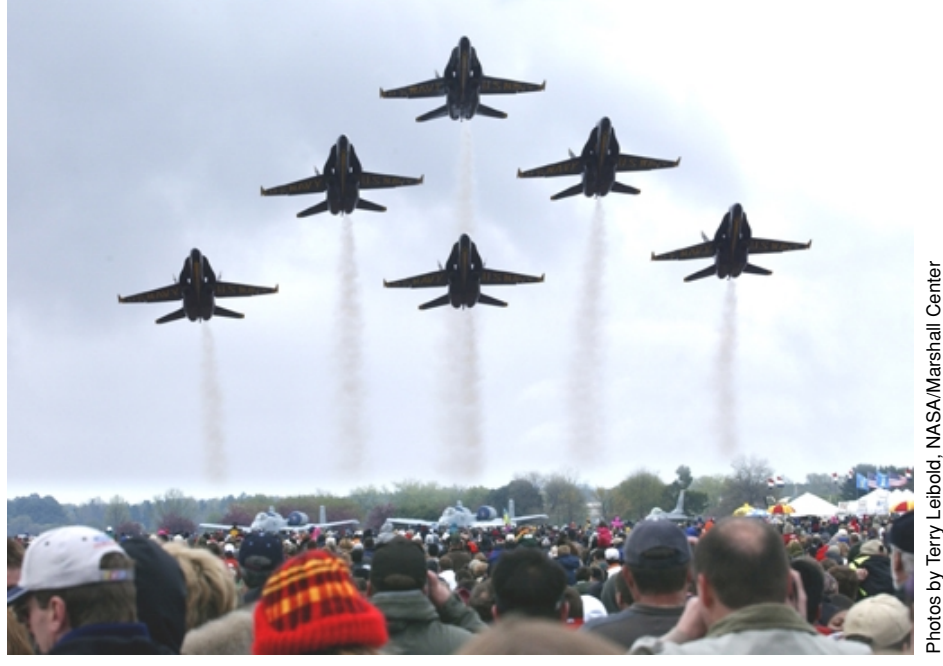
The U.S. Navy Blue Angels fly over the crowd in precision formation.

NASA exhibits included the Johnson Space Center's "Space Station Imagination" comprised of two 48-foot trailers linked to form a mock-up of two modules of the International Space Station.