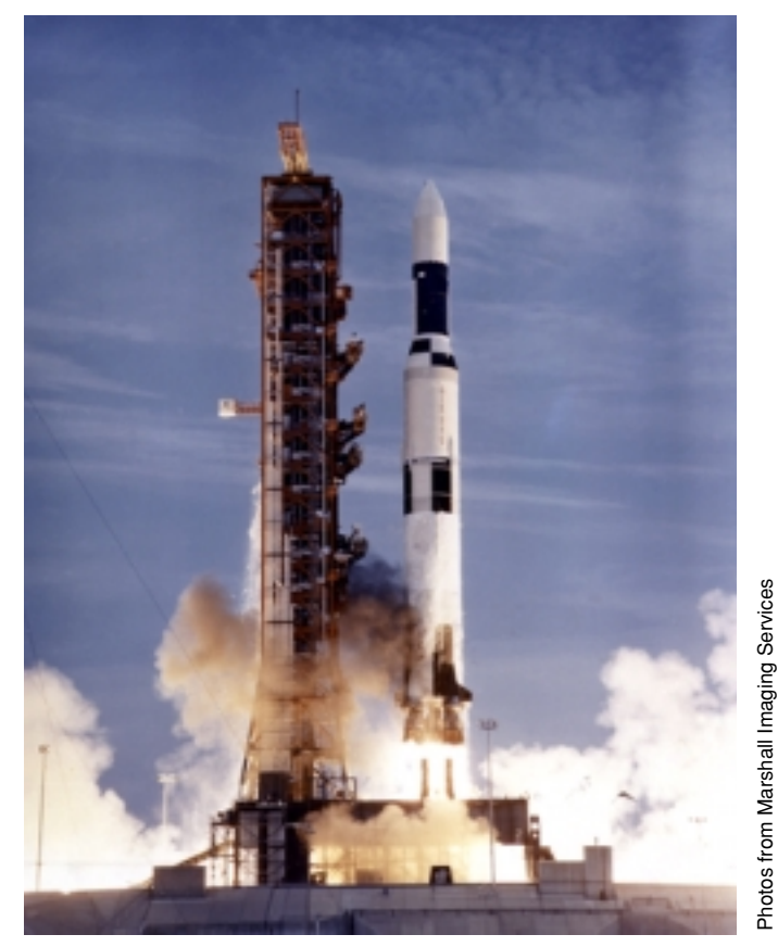
A modified Saturn V launches Skylab into orbit on May 14, 1973.