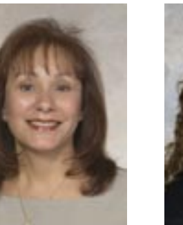
MARSHALL STAR 8