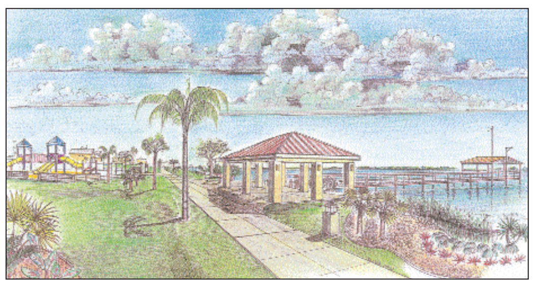
Riverwalk, a wide path that will stretch along the shores of the Banana River from the tip of North Housing to the Family Campground, is one of many improvements 45th CES is implementing at Patrick Air Force Base. The path will allow people to enjoy a view of the river and take a leisurely walk or exercise without traffic concerns. The first phase of the project begins soon. (Artist rendering courtesy of 45th CES)