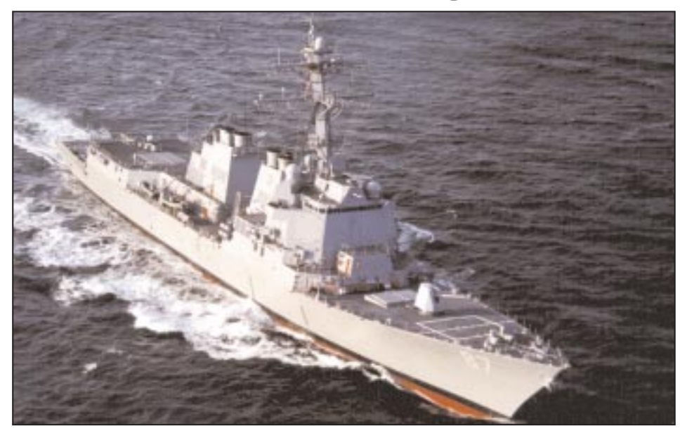
The USS Mason heading to its commissioning at Port Canaveral this past week.

The Mason is the newest of the Arleigh Burke class destroyers and carries an array of advanced weaponry, including the Aegis antiaircraft missile system, Tomahawk missiles, an