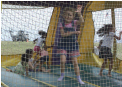
The children had a wonderful time in the bouncy house.

There was plenty of fun filled activities for Marines and their families. Background music was provided by “the world famous” MARFORPAC band and DJ Pack. A favorite with the kid’s was dunking the Marines in the dunk tank. At the KV tent