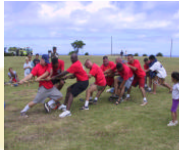
The Marines of S-4 give it their all in the Tug-O-War contest.

gathered to join the CO and SgtMaj in a round of Tug-O-War. A special thanks to the KVs and all the Marines and families that helped put together this successful family event. See you next year!