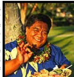
World famous Hawaiian chef Sam Choy will be our the guest speaker on Oct 17th.

The joint women's conference is a two day workshop for military spouses from all branches of service aboard Oahu, HI. This two day conference is set up to inform and pamper the military spouse. This year the workshop is scheduled for Friday and Saturday, Oct 18-19. There will be 50-70 exciting workshops for those attending. On Friday Sam Choy will hold an hour long cooking demonstration for all participants. Ladies are encouraged to bring their cookbooks for Mr. Choy to sign at an autograph session after his presentation. All recipes used during the cooking demonstration will be served for lunch.