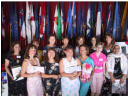
Thirteen wonderful door prizes were given away, thanks to donations by local businesses and KV's.