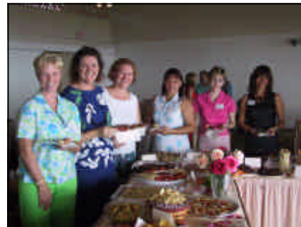
Spouses enjoyed a wonderful display of food prepared by each of the Key Volunteers.

The guests were many and the food overflowing on February 23rd at the Sunset Lanai. Our first Deployed Spouses Social was a great success, bringing together many spouses of Marines/Sailors who are currently deployed. The attendees had the opportunity to eat, learn and socialize with spouses from other sections at HQSVCBn MFP, while children were treated to a fun afternoon with caregivers provided by the Armed Services YMCA AMR.