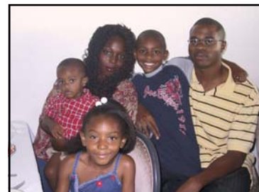
The Glovers took time out for a family photo during the holiday party.