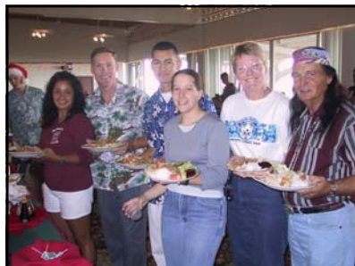
Marines and family members enjoyed a wonderful spread of food.