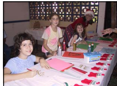
There were plenty of crafts and activities for all our HQSVCBN MFP children.